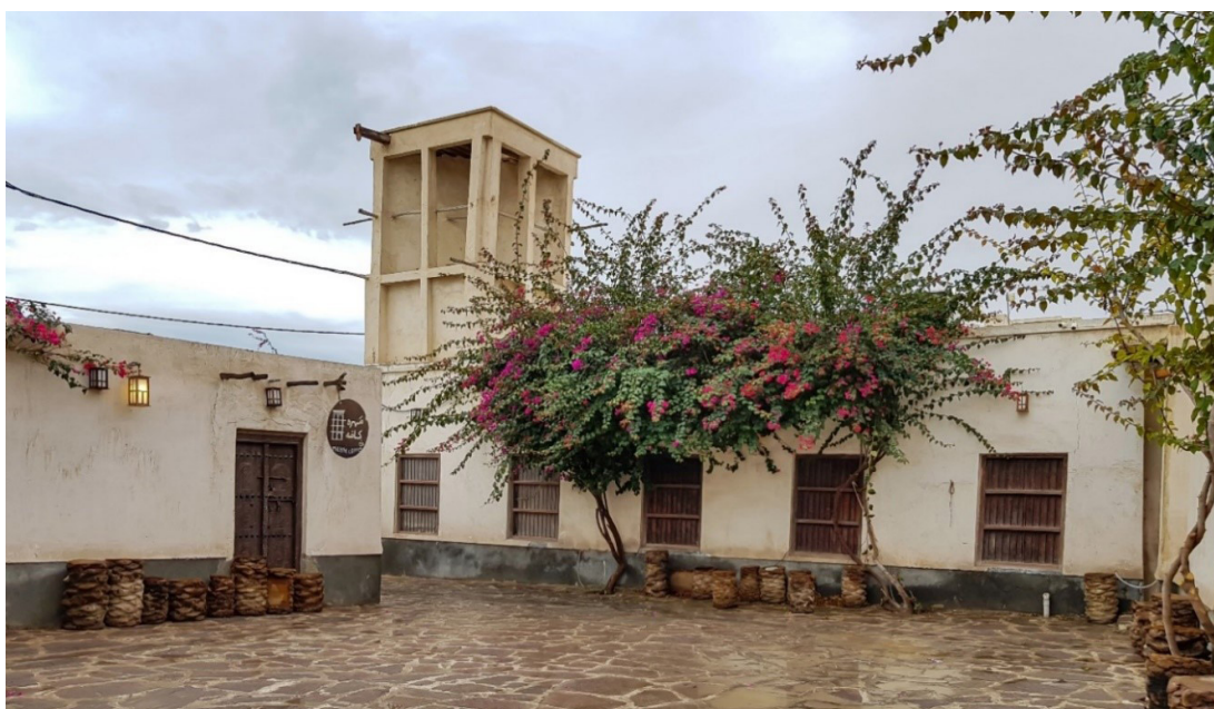
Fig. 4. Physical restoration of the historical fabric and efforts to create collective spaces.