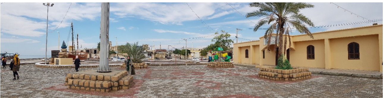
Fig. 7. Renovation and construction along the coastal margin aimed at creating new collective spaces.