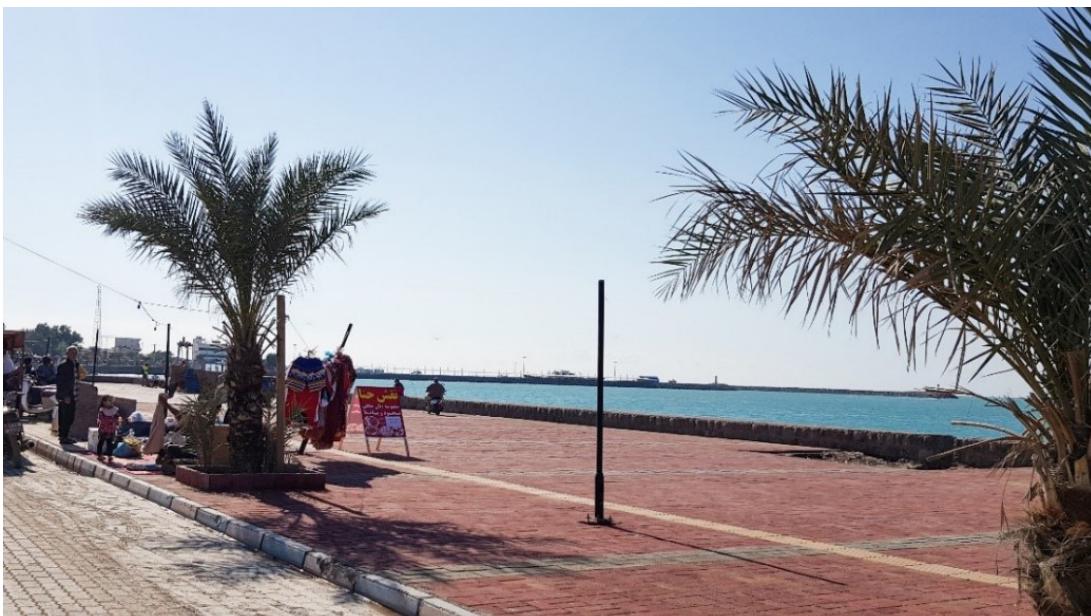
Fig. 3. Renovation of pedestrian paths and streets along the Hormoz Island periphery indicating attention to the waterfront fabric.

The initial core of Laft village was formed in the ancient and central part of the current village, near the water wells and reservoirs and along the coast. As