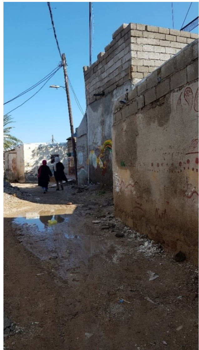
Fig. 2. The dilapidated pathways of the traditional Hormoz fabric in contrast with the renovated pathways along the island's periphery.