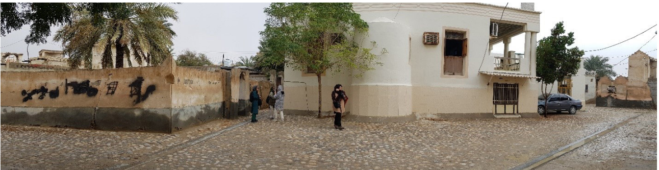
Fig. 6. Traditional collective space in the historical fabric of Laft, related to the mosque and traditional rituals.