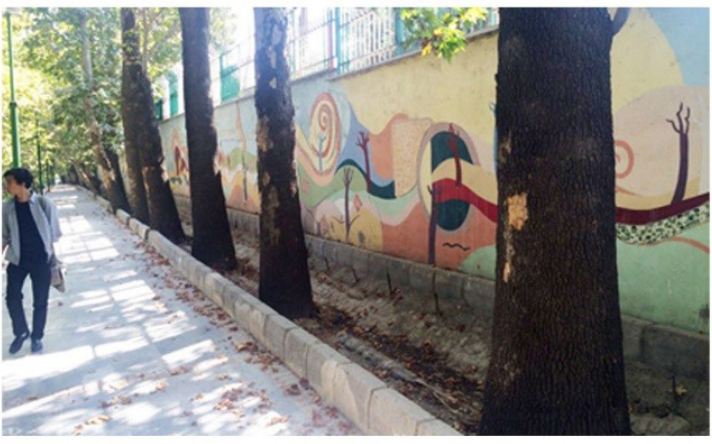
Fig. 2. Murals in the southern zone of Vali-E-Asr Street are fewer under the influence of the urban fabric of this zone and changed the functional nature of the street becoming a commercial zone compared to the similar sample (second zone).