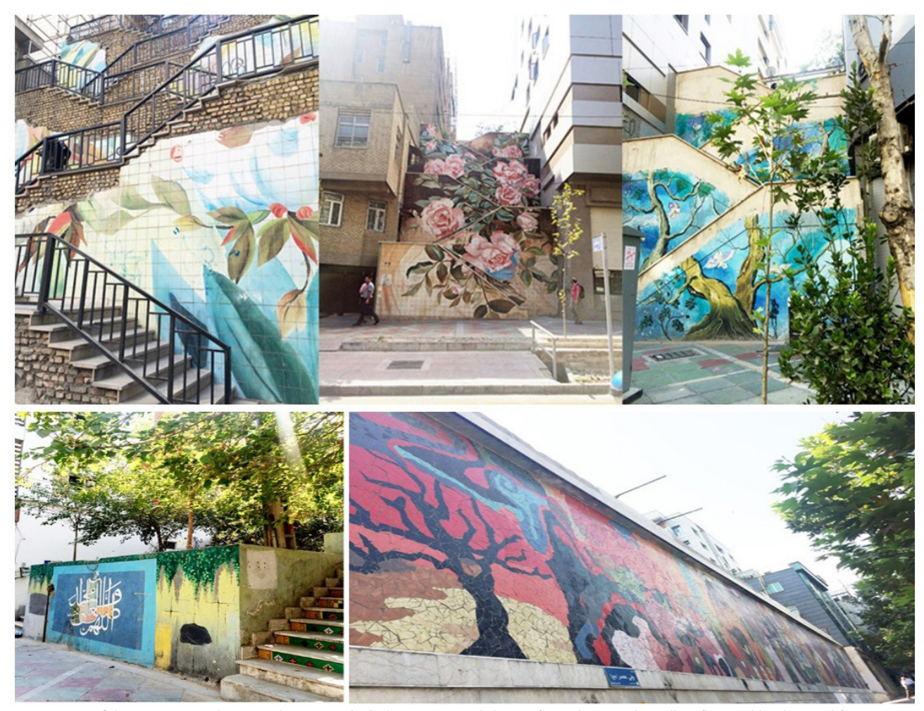
Fig. 1. A part of the paintings in the second zone, in which the content and shape of murals are realistically influenced by the need for constant protection of nature, so nature is the core subject of murals.

Granulation of urban fabric and open urban bodies and provided art platforms in addition to natural density have led to simultaneous content-structure correlation then presented to the audience, so less separation exists