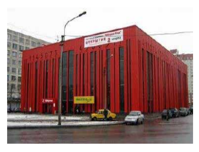
Fig. 1. Building design based on its performance (monitoring and barcode) and using warm colors in the cold and cloudy Russian climate.

space, city or even building are less concerned with its psychological effects (Husseinion, 2001). In fact, in this context, the urban designer has the mandate to work on a 3D landscape that is immense and ever-evolving. The theory of color applies to the city on a wider scale and aims to create harmony in places that are not harmonious. However, using urban color is different from using color in painting. The color quality varies from city to city, season to season and morning to evening. Thus, color coordination laws about the city are examined and applied from different perspectives (Mahmoudi & Shakibamenesh, 2005, 111). Just as home furnishings and residential environments need to be color-coordinated, the city's constituents will create a relaxed atmosphere for citizens if they adhere to the principles of color combination and coordination. In urban environments, color can be seen everywhere, on the body and facade of buildings, roofing, flooring, urban furniture, green