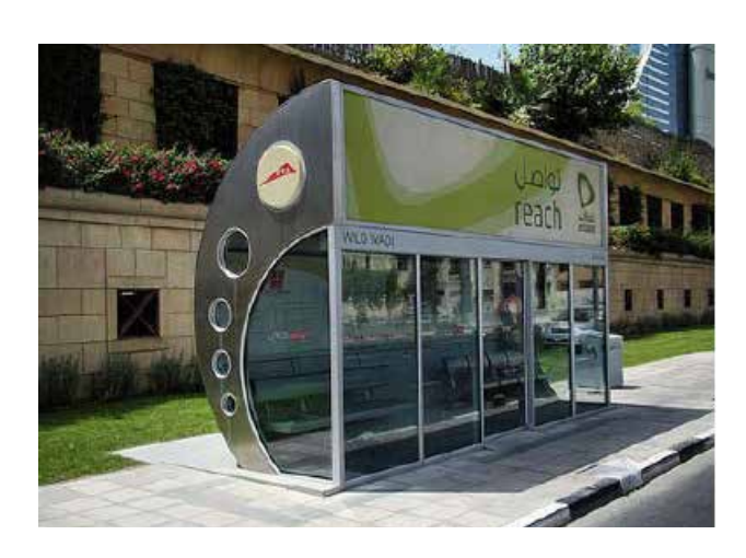
Fig. 2. Bus station with cold colors.