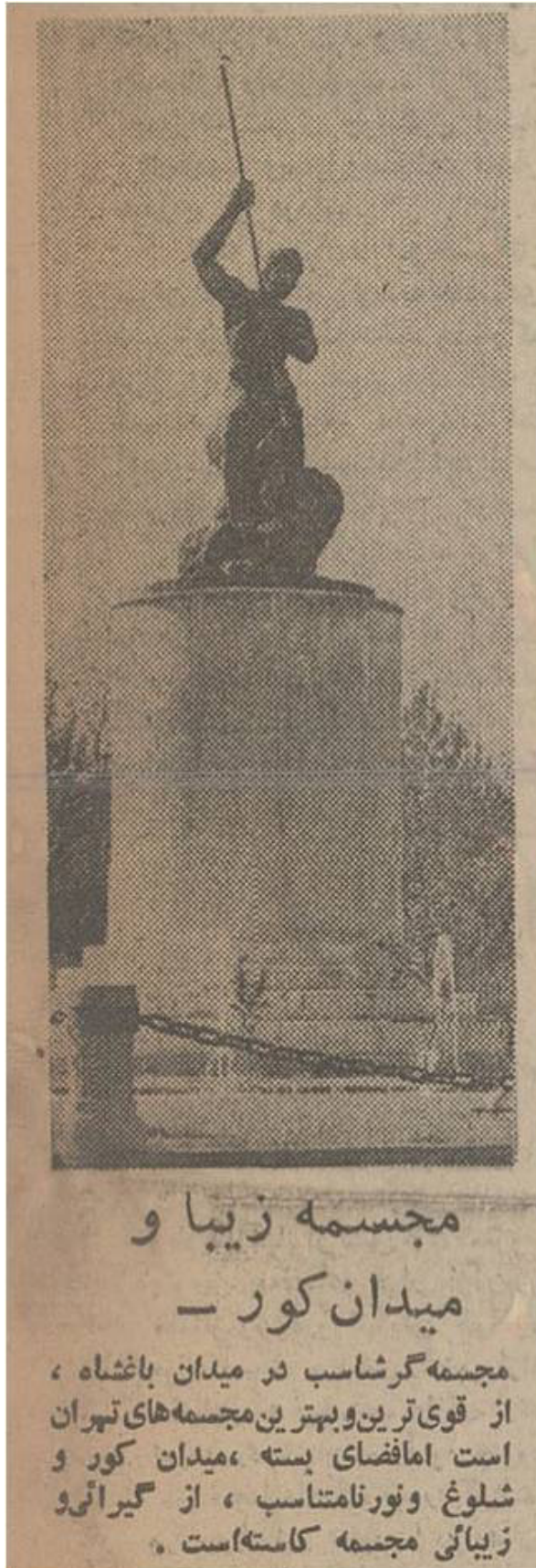
Fig. 5. The photograph of the statue under the name of Garshasb statue in Ettela'at newspaper.