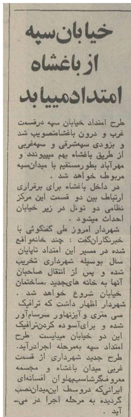
Fig. 4. Applying the name of Garshasb statue in Ettela'at newspaper.

to the reliable documents, it can be said that the target status is considered as the oldest urban figurative sculpture in Tehran squares, which fortunately has survived until now, so it is very valuable for studying the history of urban sculpture in Tehran and Iran. Moreover, it is thought to be created by an artist that considering his background activity will let us to know him as the “father of Iranian urban sculpture”, a giving name which is not that much far from the mind.