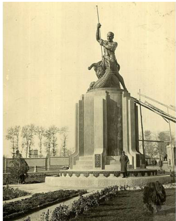
Fig. 2. A photograph taken from the current Hor Square in Tehran, the date of photo (1935/12/23~ 10/14/12 SH) is visible on the back of the photo.