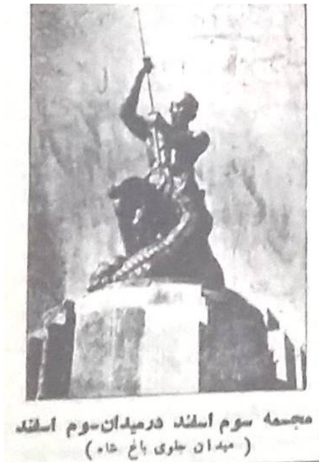
Fig. 3. The photograph of the statue in Ettela'at newspaper.

shahri ke mojasameh nadarad! [Tehran is a city that does not have a “status”!]” (Fig. 5). Of course, it is not yet clear to the author exactly from what date has the statue been called by this name, but it seems that the choice of this name was highly influenced by the content similarity of the status with Garshasb's characterization in Asadi Tousi's Garshasbnameh and the epic poem of Shahnameh by Ferdowsi, which is known as the dragon killer.