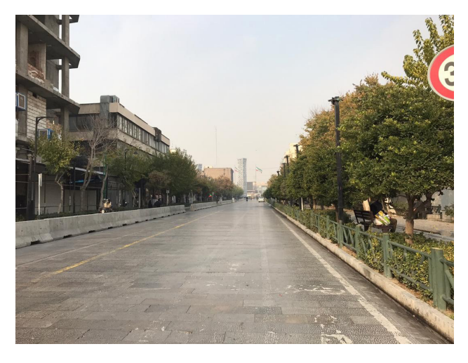
Fig. 2. The 17 Shahrivar sidewalk, with little people's presence in normal days, Tehran. Photo: Maryam Majidi, 2019.

A further review of the existing literature on participation showed that being a part of something, having a share in something, and having an active role rather than a passive presence in something is another characteristic of participation. The audience and the observer should have an integral and inseparable role in creating the landscape. Therefore, participation is realized with full capacities when the audience is taken into account. The