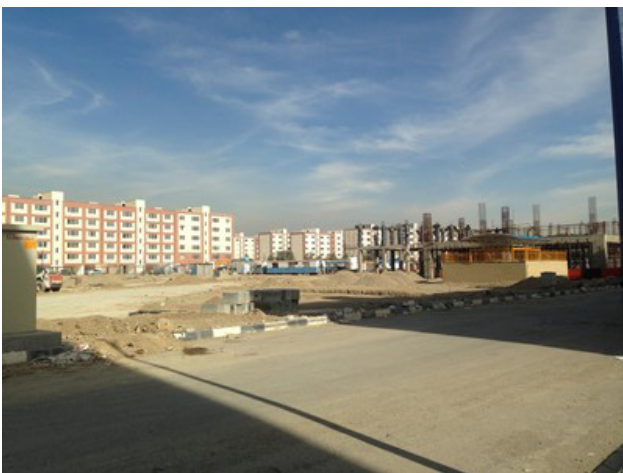
Fig. 4: Uneven congestion, creating a large, centralized service area and high construction density.

The two main categories of the current trend that has led to