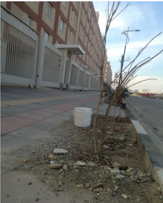
Fig. 7: Minimal tree planting and its interpretation of green space by designers, Mehr Tehransar Housing.