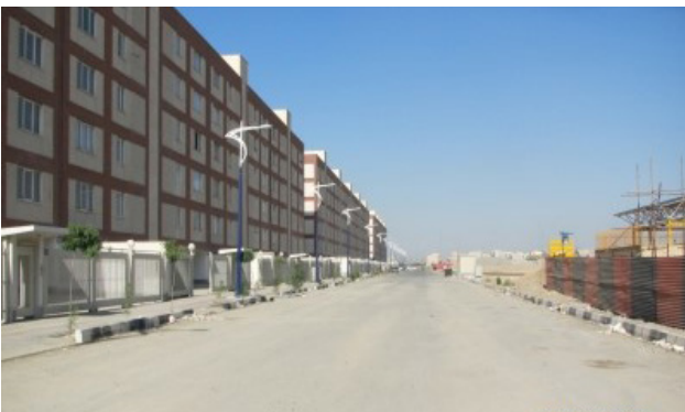
Fig. 8: Prioritization of vehicle movement and negation of any public space in the row of buildings, Tehransar Mehr Housing.

the emergence of a crisis in the urban landscape of this project can be broadly categorized as follows: