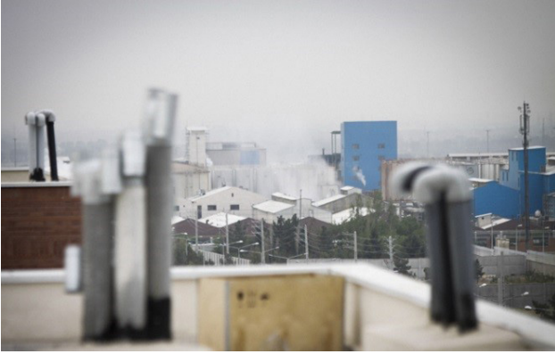
Fig. 6: Location of Tehransar Mehr Housing site in the industrial area of the city, neighboring of this project with factories has created problems for residents: Source: www.fararu.com .