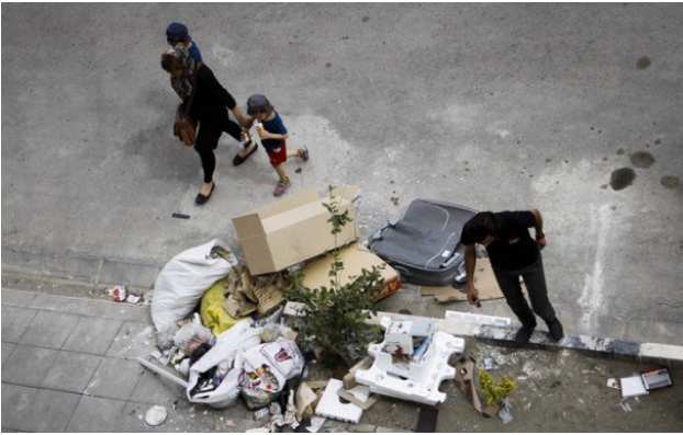
Fig. 2: Lack of existing proper urban infrastructure, Tehransar Mehr Housing.