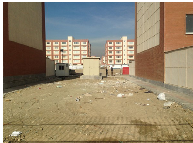
Fig. 5: Failure to define the proper context for the formation of social spaces.