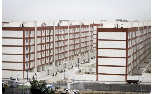
Fig. 3: Building blocks are followed by a shape without any markers to make a distinction that leads to space's unattractiveness, Mehr Tehransar Housing.

tween them. This problem goes as far as no consistent density plan is observed in the lands. On the other hand, the lack of mixed land use and considering a purely service-oriented site in the segment and a specific point on the site, as the sole provider of building needs (from services to socio-cultural welfare), first created the time and financial cost to move residents between the living space and the service area, and on the other hand, it leaves other open spaces out of service area. The most important consequence of this issue is the disproportionate distribution of population density and decreasing security in other areas that devoid of social residents are social onlookers (Fig. 4).