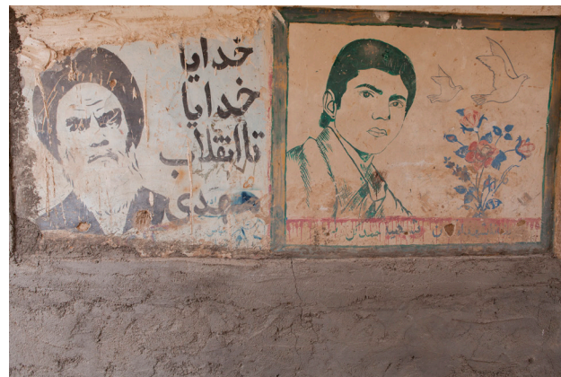
Fig. 3: Old wall paintings on Shohada Neighborhood.

Houses' entrance: Pictures of martyrs hung at the entrance of some houses (Fig. 4). Pictures of martyrs Used to serve for identification of houses like the house ID card or the house plates that showed the family to which it belongs. This mode