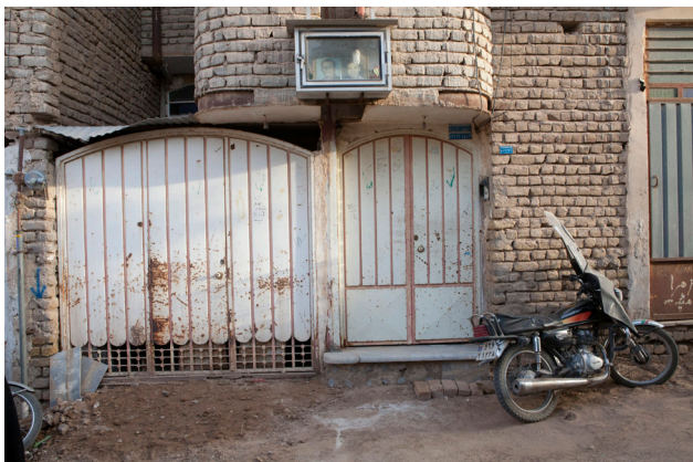
Fig. 4: Photo Usage in the Houses Shohada Neighborhood of Kashan.