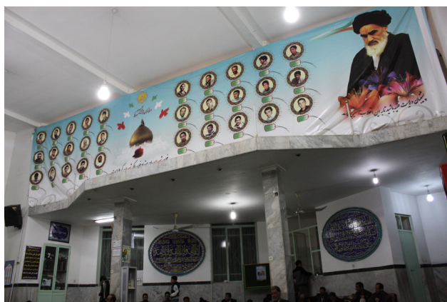
Fig. 2: A view from inside of the mosque, a picture of Martyrs, Imam Khomeini and dome of the shrine of Imam Hussein (AS). Photo: Seyed Saeid Reza Razavi, 2017.

In public spaces, the place of martyrs' images are in the mosque, alley, and street and, finally, at the entrance of some houses examined: