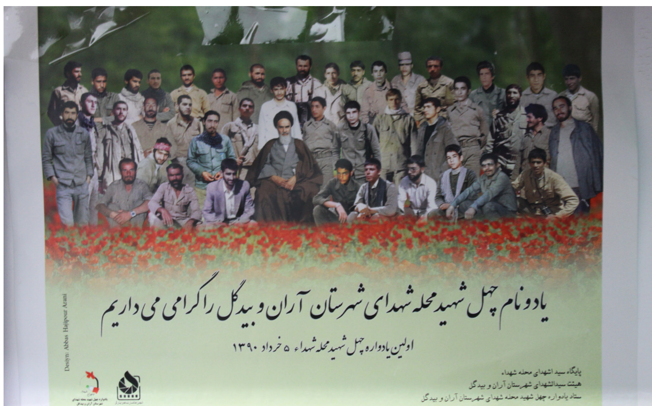
Fig. 10: Collective picture of martyrs with Imam Khomeini.

In both public and private spaces, the martyr's photo is alongside the photographs of the leaders of the revolution. The image of the martyrs and Imam Khomeini in a single frame is a symbol of sacrifice and obedience to God's command. The images of martyrs in urban spaces have established a good relationship with the social atmosphere at any given time. After the war, particular attention paid to the installation of