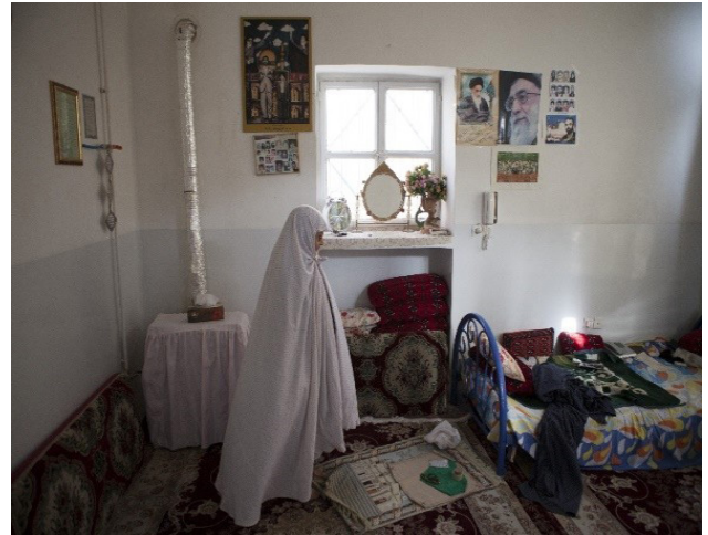
Fig. 8: Placing images in the private space of the martyrs' house. Photo: Seyed Saeid Reza Razavi, 2017.

these photos are combatants' private photos, group photos, and other single photos. Of course, when space is limited, dividing the house spaces into two parts is not possible, and the photos placed in the only room of the house.