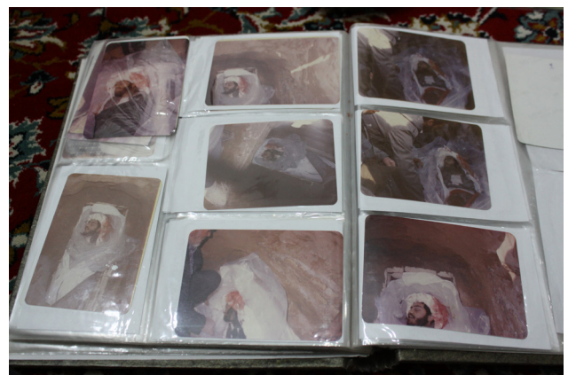
Fig. 9: Pages from an album related to the martyr's burial.

Restored copies of old photos: Including photos that restored by photo editing software (such as Photoshop) which have bright, sharp and high contrast colors. Locals who have little knowledge with the new digital tools, made these copies for the happiness of the martyrs' families or to be used at the martyrs' memorial ceremonies. Restored photos can revive the martyr's image for the family. Sometimes, these young people print and install posters or banners from several martyrs in public spaces to commemorate the war martyrs. Another group of restored photographs is images made with digital editing software, in which several martyrs' images placed together and a new photo created with a new background. Some of these images help identify the mentality of the martyrs' families. One of these photos, which the families of the Shohada Neighborhood are very interested in, is a picture of all martyrs in the neighborhood and in the middle of it, is an image of Imam Khomeini (Fig. 10) Despite all the technical shortcomings apparent in this photo, in all houses