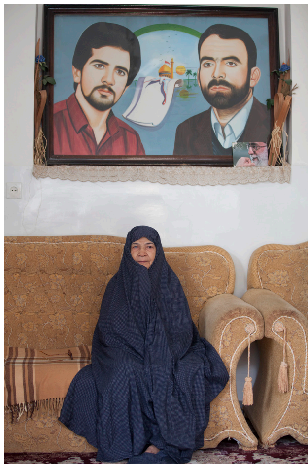
Fig. 6: Official home space and decorating space with official photos.

Home's private spaces: More private photos placed in spaces at homes that are used by the household (Fig. 8). Some of