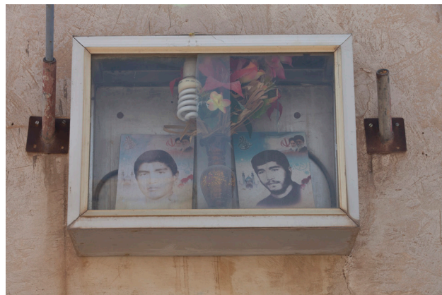
Fig. 5: Photo Usage in the Houses Shohada Neighborhood of Kashan.

of representation was standard during the Iran-Iraq war and a few years later in many parts of Iran. However, today, the number of these photo frames have diminished on the entrance to the houses of the martyrs' families. While at the entrance of the house, the martyr's image welcomes the guests and is a blessing. Sometimes, the presence of flowers, pots, and rose water beside the images is a symbol of refreshing, living, and beauty (Fig. 5). This presence is so pseudo-real that sometimes the images are decorated by prayers and the Nazar amulets to ward off the evil eye from the martyrs. It can say that the use of images of martyrs, especially in urban public spaces, is a way to confront the cultural invasion and the youth crisis, in addition to identifying and remembering the sacrifices of martyrs. This strategy is approved by the middle class, the state, and the working class because it brings the values of the previous generation to the new generation only by using the visual expression. The presence of these images in urban life creates a peaceful association between the values of martyrs and the everyday life of individuals and provides a platform for experiencing memories of martyrs and their courage in a different place and time.