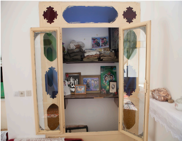
Fig. 7: A small museum of two martyrs in the corner of the house.