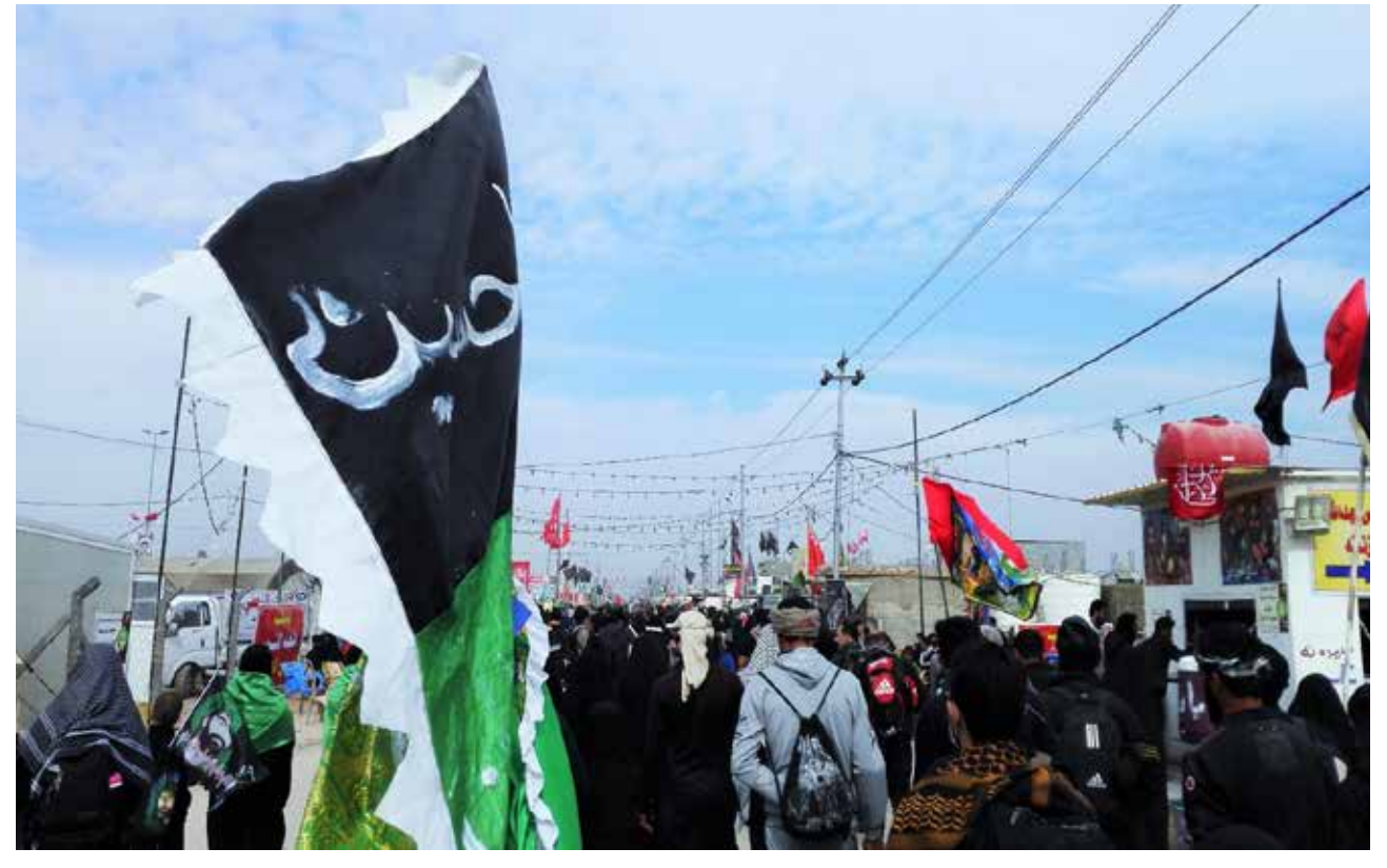
Fig. 2: The mourning parade in Arba'ein.

Amongst the immaculate Imams, as well, Imam Hussein