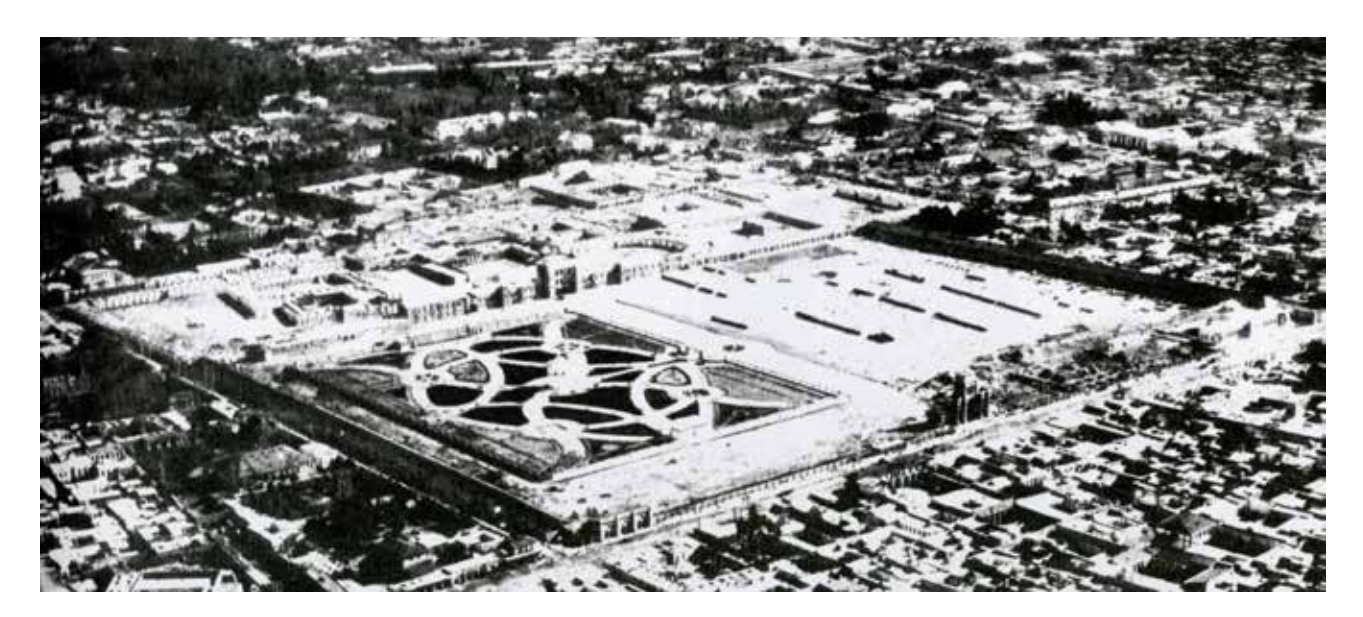
Pic 4: Aerial Photography of Tehran National Garden.

Today, trees and plants are used as merely decorative objects due to the influence of culture and beliefs that have imposed their theoretical view on human societies (Zamani et al., 2009). In modern urban parks, a large number of trees are planted that are separated from daily activities of people. As seen in its early examples in National Gardens and City Park, the trees are centered in a specific area and the people can walk along the specified paths in the park. In fact, the trees in the park do not have individual identities. Therefore, in this new type of green public spaces, the plants have lost their sense of holiness and the people's mentality of the trees is changed toward urban parks.