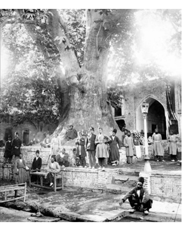
Pic. 2. An old plane tree near Imamzadeh Saleh.

intellectual influences of the Constitutional Movement and the presence of the new class of Western graduates alongside the governmental class, who believed in transformation of the political society from traditional to modern, is in fact the perspectives of the cultural policies in this period. Intellectuals of this period believed that avoiding the traditions and religious culture ruling the Iranian community is the key to achieve Western civilization (Alam, Dashti & Mirzai, 2014). Green space in Tehran during the first Pahlavi period