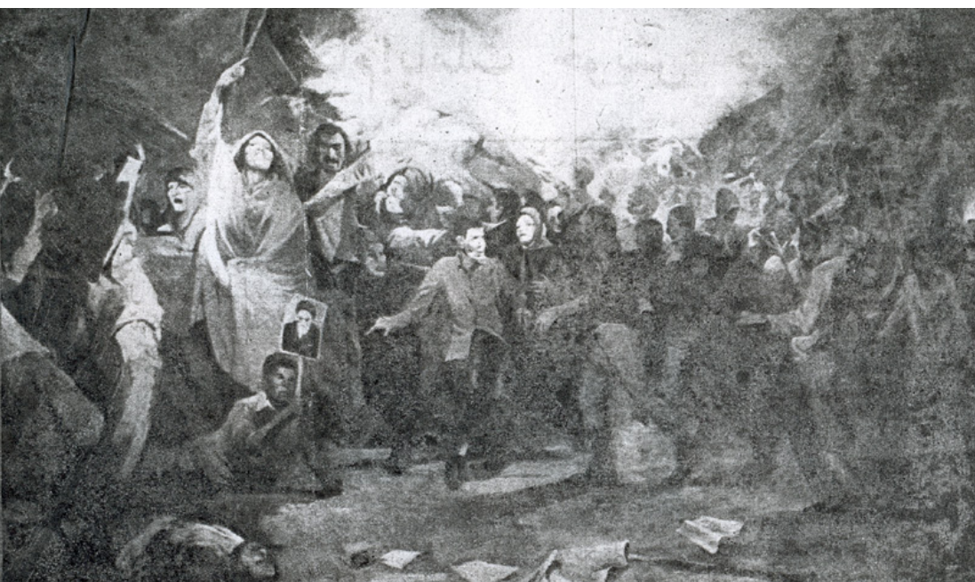
Pic 2: A painting titled "Hefdahe Shahrivar".