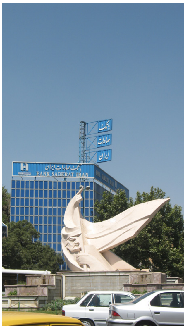
Pic 14: Statue of a man and a woman battling against the enemy; Ostandari square in Sanandaj.

By displaying a collection of his artwork with the subject of war and the holy defense Eskandari ended his speech including the works which were executed in the Ostandari square In Sanandaj during the early years of the revolution. By using concrete with the dimensions of 6 in 7 meters, symbolically a figure of a man is shown which is pointing upwards and on the other side is the face of a woman (Pic. 14).