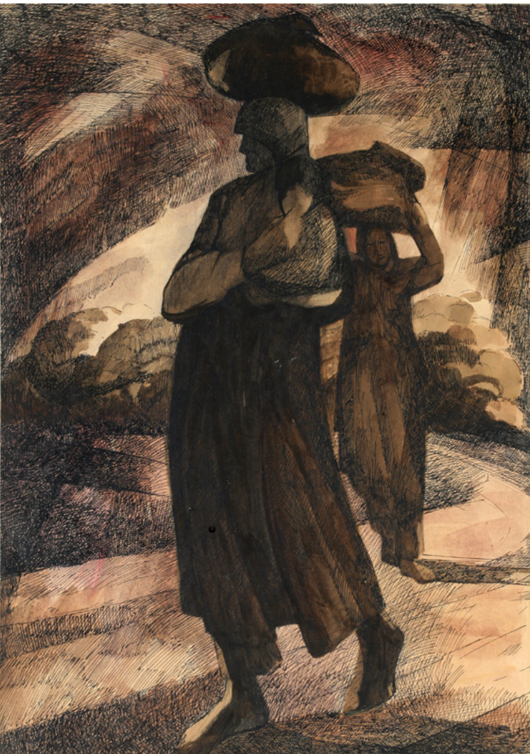
Pic 5: Usage of lines and composition to introduce the war and its related concepts. A symbolic painting showing migration and displacement.