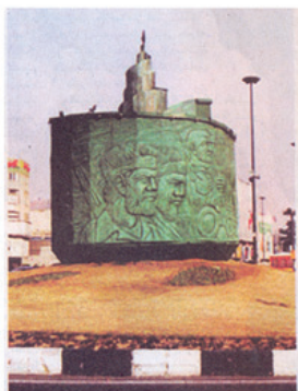
Pic 12: An artwork painted as a mural is implemented in Enghelab square as a model.