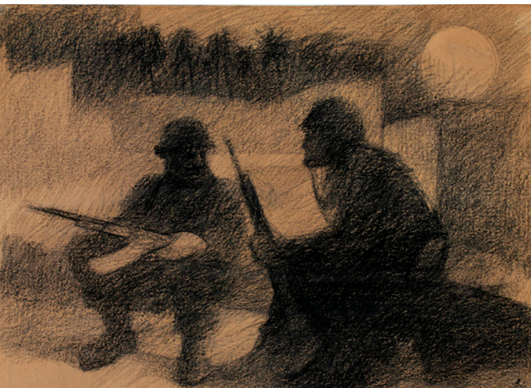
Pic 3: A constructivist design, two militants talking together.

In this collection which is partly accompanied by symbols and signs, the artist has used composition and the background of the artwork in expressing the concepts of war. In this collection narrations of destruction, homelessness and the loss of loved ones is illustrated such as picture No.5 that shows the migration of people from war zones. In this painting the artist tries to use his personal language in transferring the concepts of war to the audience by using pen movements, composition and background. For example, in this painting the composition and movements reflect the happenings of the war. Two explosions are displayed in the background and