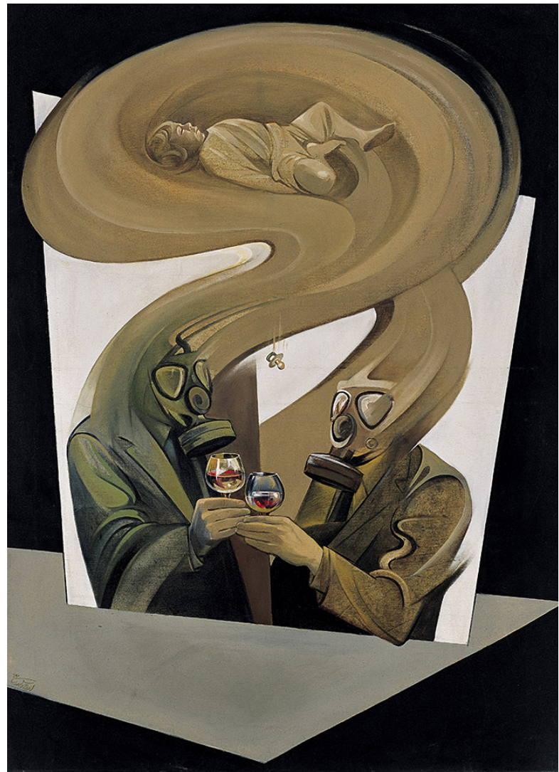
Pic 8: An art work with the subject of "Halabcheh chemical attack".