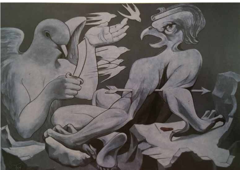
Pic 11: Two Symbolic birds express the confrontation of the evil and the good.

Among the artworks displayed in the wall-painting field that has started in the early years of the revolution, the artist created paintings in the area of diverse compositions according to the war and revolution atmosphere by utilizing his experiences. Among others is a work that was painted in 1982 that consists of 12 pieces with the dimensions of 3 in 12 meters. In this painting which was actually retrieved from pictures of a war related book, a narrative of the formation