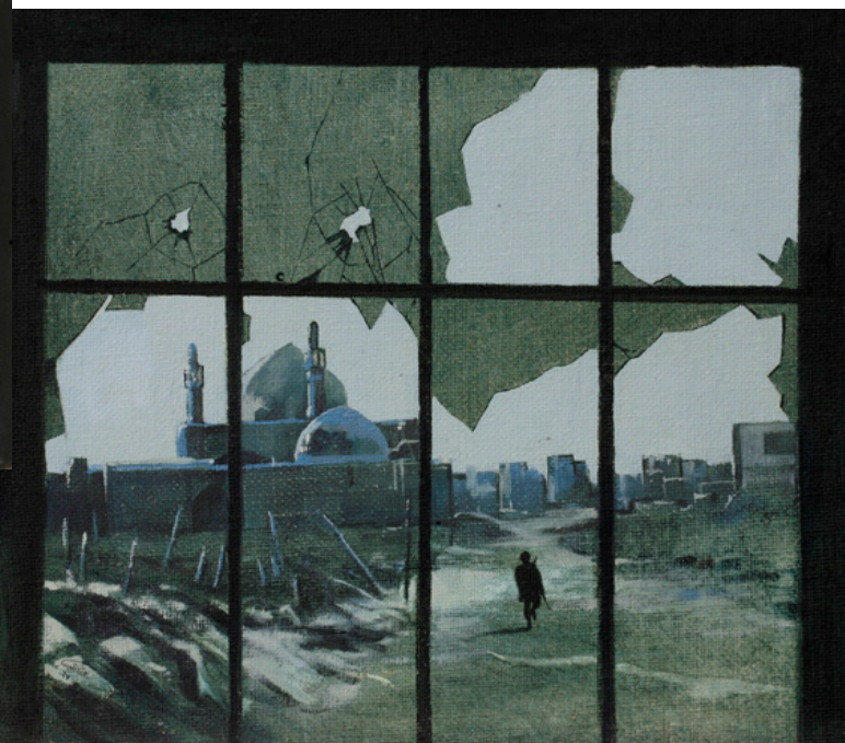
Pic 9: An artwork with the subject of Khoramshahr's war ruins.