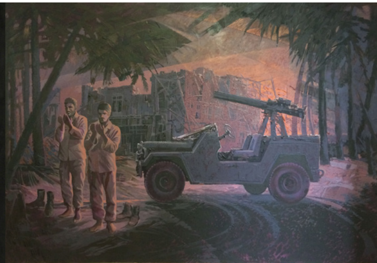
Pic 7: A scene of two militants showing their environment and beliefs.

In another set of artworks, the role of symbols and signs is strong. Symbols such as white bird, red fish, Damavand Mountain are seen in this collection. For example a painting that illustrates a militant wearing a green snood in the foreground that is staring at the Damavand's mountaintop, a mosque and a village on the hillside in the background. In another painting, by copying from Picasso's artworks the