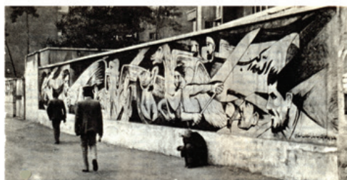
Pic 13: A wall painting in Enghelab Street: A symbolic contradiction between oppressor and the oppressed.