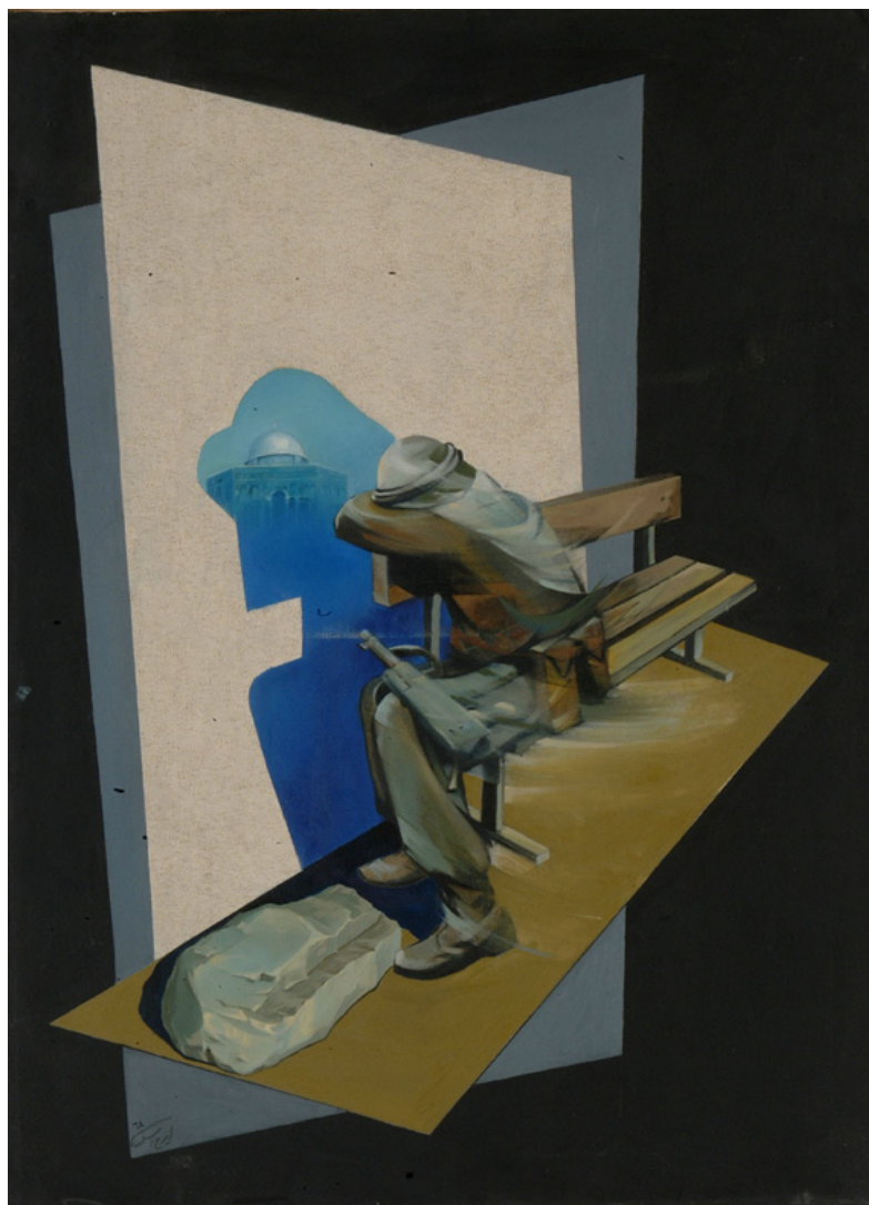
Pic 10: An artwork with the subject of "Palestine".