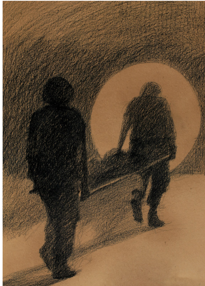
Pic 4: A symbolic and semantic design; showing two militants carrying a martyr's body.