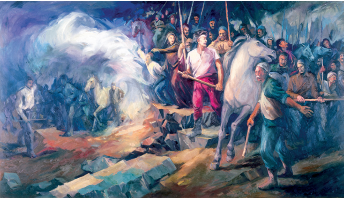
Pic 1: A painting titled "Karughloo", a symbol of people's movement leading into the revolution.