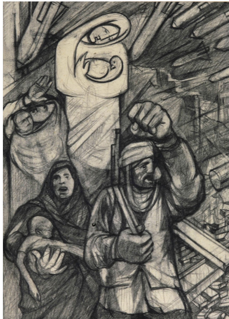
Pic 6: An art work named "Resistance"; usage of composition to introduce the concept of war's cruelty and the presence of hope for peace.