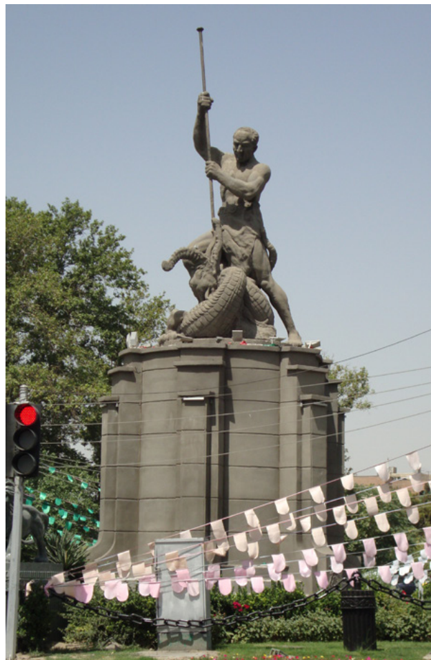
Pic 4: The presentation of revolutionary concepts and freedom by mythical approach, The status of Gushtasp and dragon. Photo: Azadeh Ghelich-Khani, 2015.

style and by using of iconic elements such as swords and spears, indicating the fights and battle. During the Pahlavi II (probably 1960) the sculpture of "Gushtasp and Dragon fight," which was built to commemorate the rescue of Azerbaijan from the Soviet occupation and today is installed in the "Hor" Square and is following to the mentioned concepts. Another example, is the status in Mokhberodoleh square that was installed after the coup of 28th Mordad (August). The statue was showing a dragon in front of a military and a civilian with a flag base and a spear in his mouth (Pics. 4 & 5).