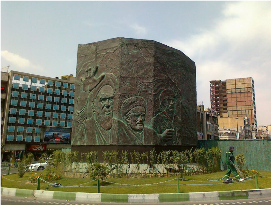
Pic 6: The first narrative presentation of the Islamic Revolution and Martyrdom concept in an urban sculpture, Enghelab Square.

political function with strong impress as toppling a square status would be equal to the change of the regime.