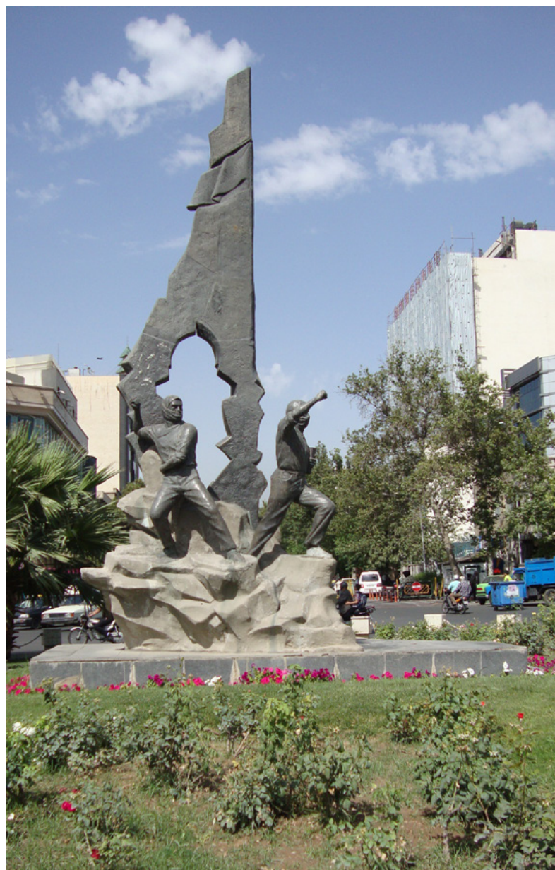
Pic 7: The first figurative urban sculpture after the Islamic Revolution that refers to the subject of war. Felestin (Palestine) square. Photo: Azadeh Ghelichkhani, 2015.

an academic desipline and students accepted in this course in 1993 (Pic. 7). During this time course the first urban statue of a revolutionary warrior – the martyr Ayatollah Modares - is presented at the Parliament Square (1996).