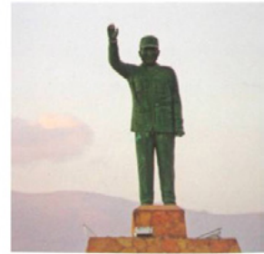
Martyr Ahmad Kazemi Shahid Kazemi Garden