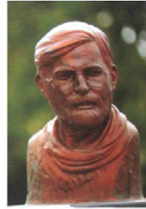
Martyr Avini Avini Garden