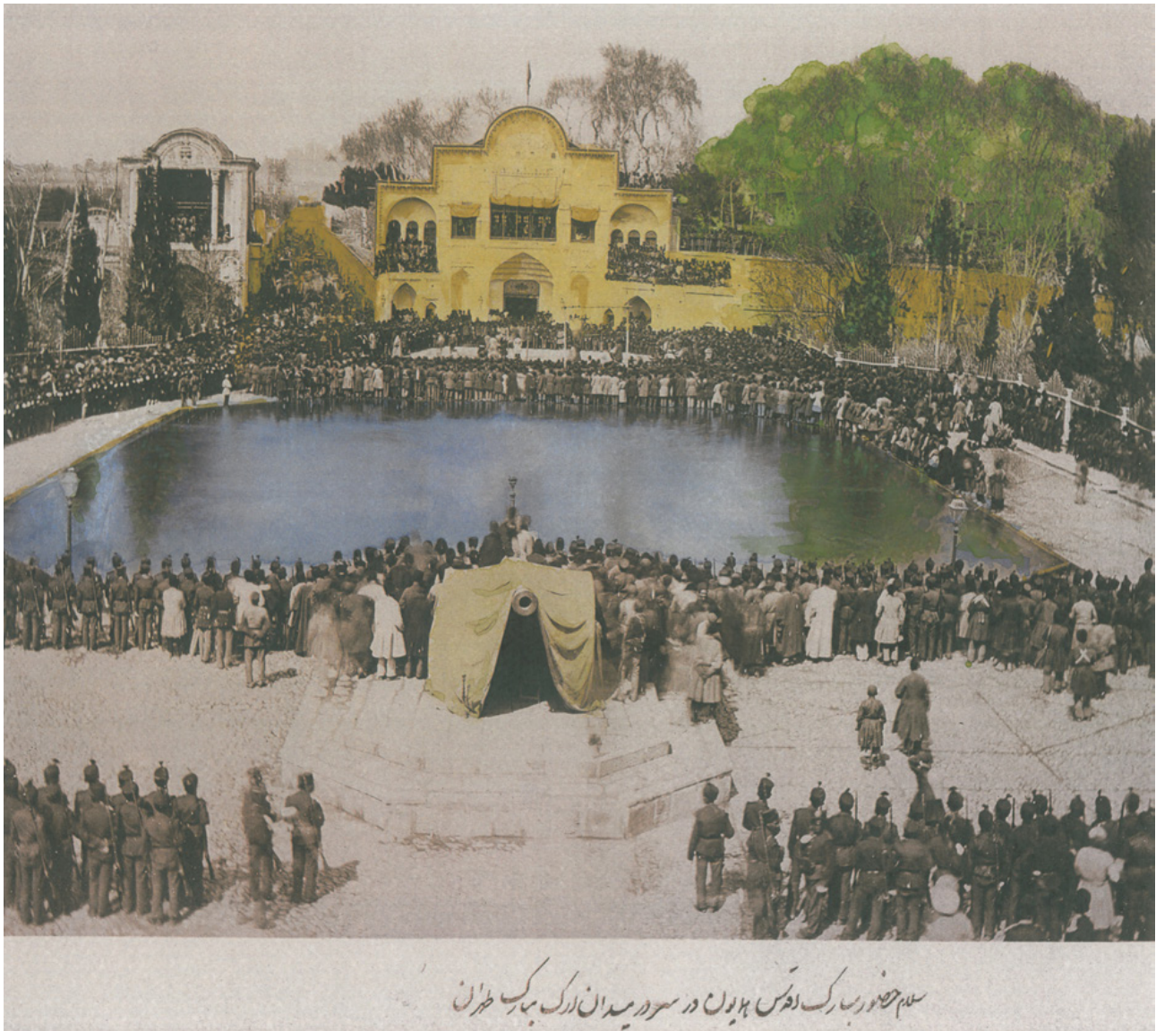
Pic 1: The Pearl Ball is an example of an urban volume that implies the war issue. Arg Square.