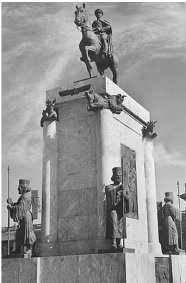
Pic 3: The cavalry statue of Reza Shah, with emphasis on archaic patterns, Sepah Square.