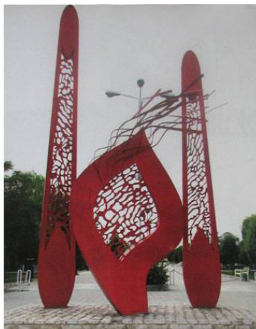
Martyrs Memorial Bahman Garden