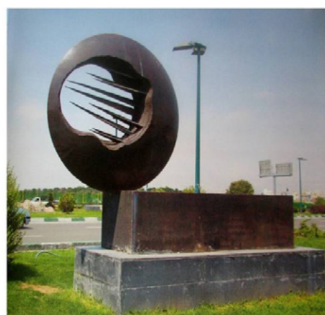
Symbol of Veterans Fath' Square