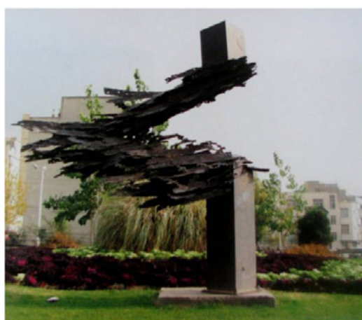
Symbol of Resistance Shahid Sayad Shirazi Highway