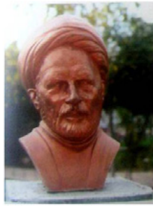
Martyr Aboutorabi Shahrvand Garden