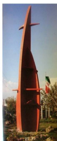
Symbol of Resistance Shirazi Square