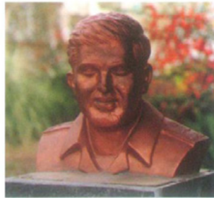
Martyr Ahmad Kazemi Shahrvand Garden