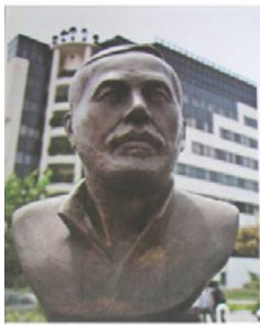
Martyr Dadman Shahid Dadman Avenue

subject of martyrs does not only return to those of the Iran-Iraq's war (The martyrs Fahmideh, Jahan-Ara and Hemmat) but the whole revolutionary warriors and commanders who were killed during the mission or terrorist attacks are also considered as the martyrs (Including the martyrs: Bahonar, Rajai, Motahari, Modares, Beheshti, Navab Safavi, Avini, Raiis Ali Delvari, Dadman, Ahmad Kazemi and Sayyad Shirazi). However, the other notable point is that it seems a kind of patriarchal look prevails constantly over this