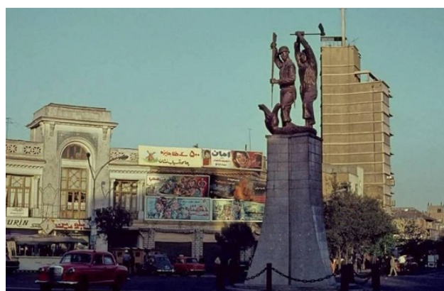
Pic 5: The presentation of revolutionary concepts and freedom by mythical approach, The status of Mokhberodoleh Square, Source: http://qademqademha.blogfa.com .

1) The statues that are considered as an exhibition of the warriors, military power, hegemony of political leaders and