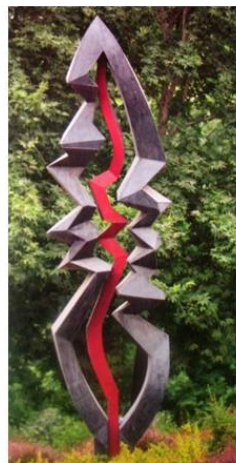
Memorial for Martyr Bahonar Shahid Bahonar Square