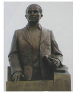
Martyr Rajaei Behesht Square