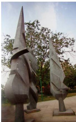
Martyr's Memorial Imam Ali Garden