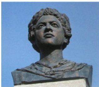
Martyr Fahmideh Basij Highway