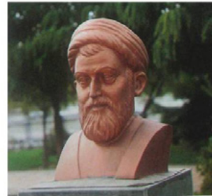
Martyr Beheshti Shahrvand Garden