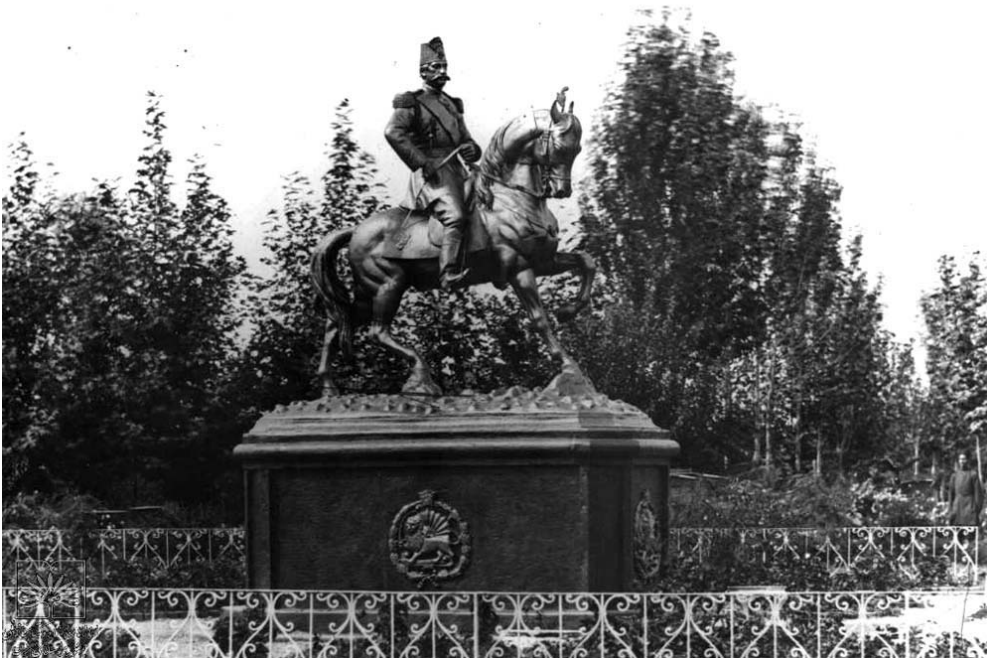
Pic 2: The cavalry statue of Naser al-Din Shah, The first instance of urban figurative sculpture. Bagh-e-shah Square.