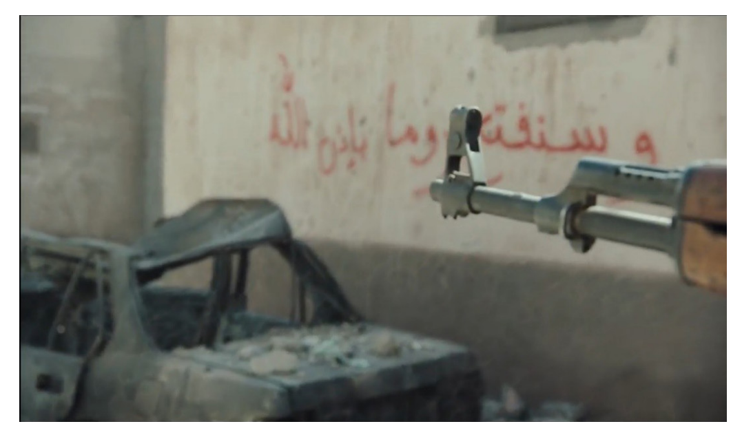
Fig. 2. Writing slogans on the wall as an expression of opinion against guns as a symbol of force, a sequence from the movie Mosul (2019).