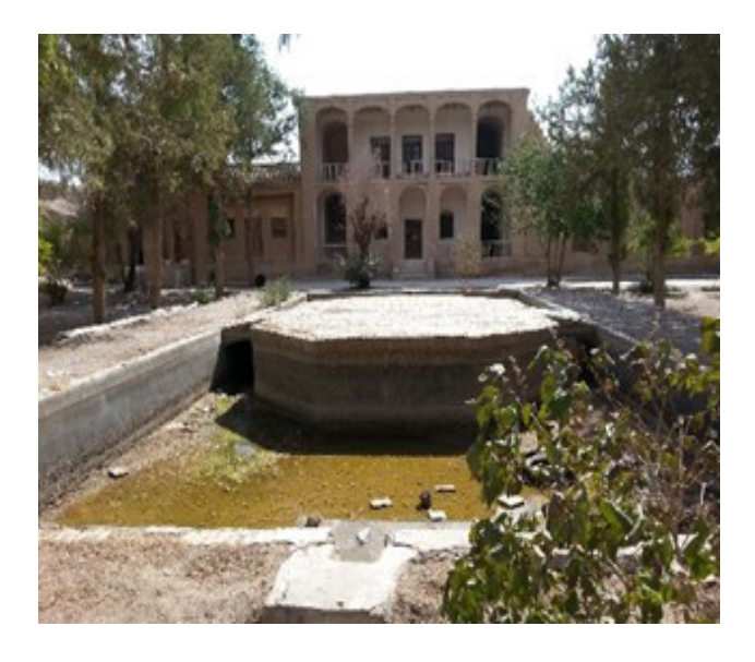
Fig. 5: The main pavilion in the privates space and the pond and the platform in front of it.

Along the main axis, the yards emphasize on the garden geometry, and the prevailing geometric principles of Persian gardens is also visible here. Most of the places in the garden is allocated to the geometric yards used for cultivation, and it can be said that the owner of the garden somehow had his/her own agricultural field in the garden enclosure and used them.