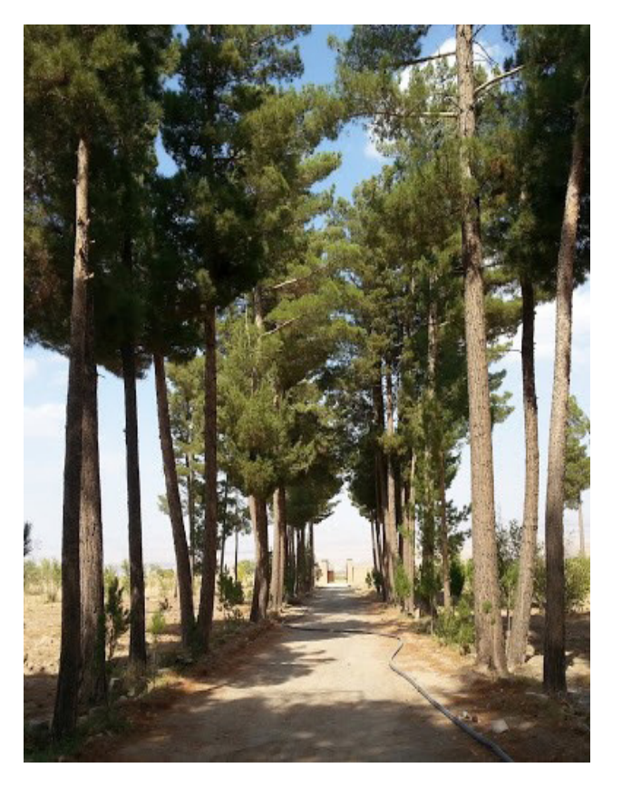
Fig. 3: The view from the main axis to the main entrance on the northern side and absence of water in the axis. Photo: Mehdi Fatemi, 2005.