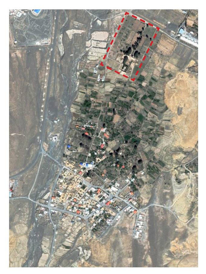
Fig. 1: The location of the garden to the village.

Along the village of Bahlgerd, on the western side of Bahlgerd Garden, there is a seasonal river from which the water flows from Bagheran Mountains to the valleys in rainy times. Thereafter, it irrigates the flat plains where