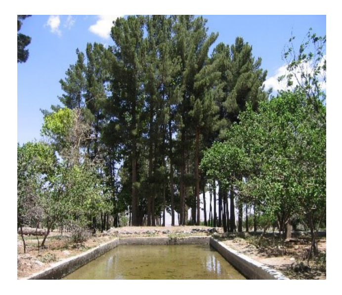
Fig. 4: Between the yards in the garden, there is no favorable view to the garden axis since the building has one floor.

the open space on the northern side of the main axis of are the other features of this garden (Fig. 5).