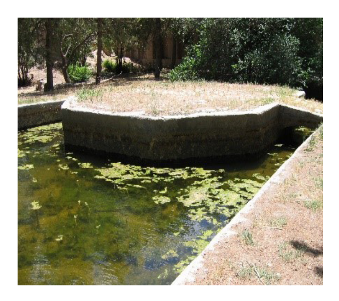
Fig. 7: The platform of the private space.

an entrance hall of a mansion with a courtyard in the middle. Having passed the entrance, the observer reaches the vestibule that leads to the inner private garden and the two-floor pavilion is displayed on the southern end of the private courtyard.