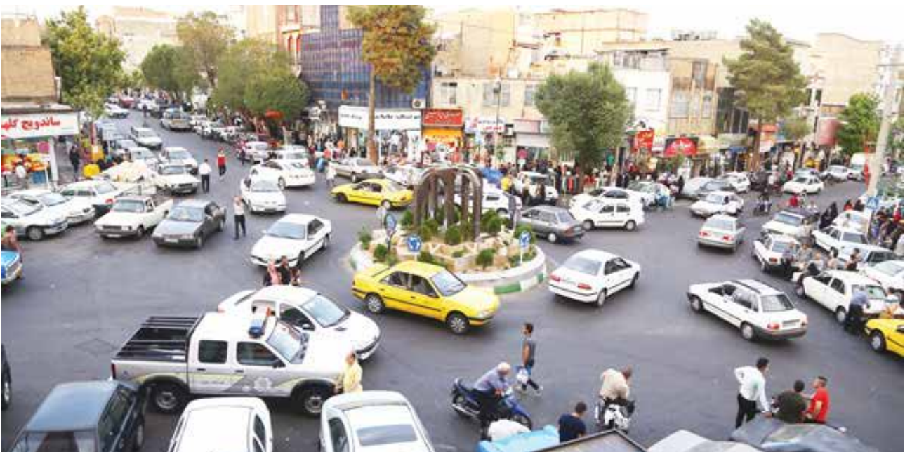
Fig. 2: Pakdaman Brothers Sq. in Shemiran_e_now neighborhood.

"It is crowded, really crowded. First of all, there is no rule. The cars are parked doubly and triply and the traffic jams continues to the end of the street ... Also, there is a large deal of traffic ... That is for the bazar ... (Neighborhood center) is considered as the main route ... Because the perimeter is rather closed here or it is completely surrounded all around it and it has become more like a plaza (and a place for commuting). ... we have a lot of