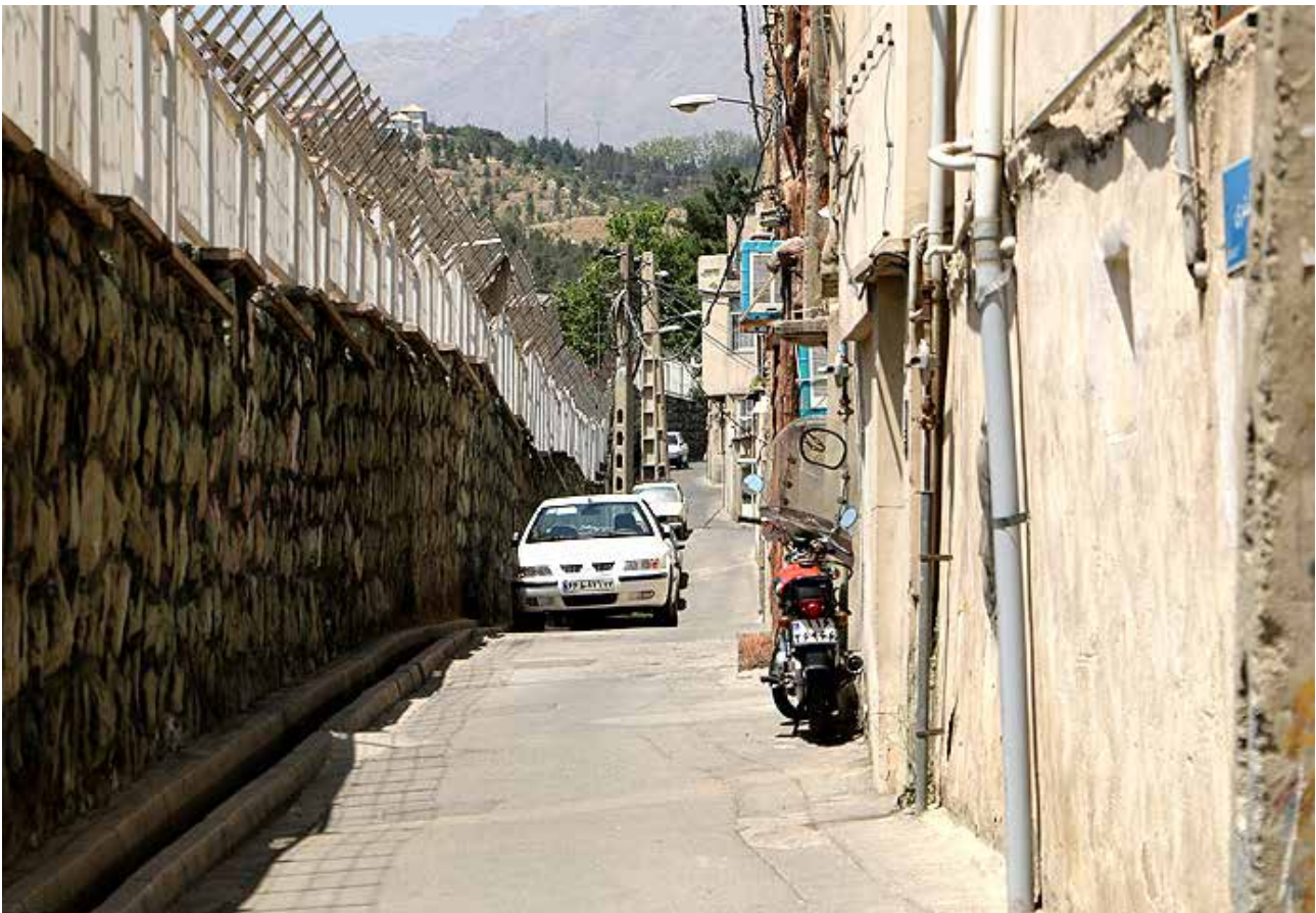
Fig. 1: Shemiran-e-now, an example of the informal neighborhood center.

or solve their housing problems (Kazemiyan, Ghorbanizadeh & Shafia, 2012). The landscape of an informal neighborhood can be considered as a cultural event in the temporary urban landscape that, besides its entire rapid environmental changes, accommodates social interactions featuring an identity that can be narrated and recognized (Cheshmeh & Karimi, 2011). The investigation of an informal neighborhood's landscape is a sort of narratology and description by the residents of their emotions and perceptions about the neighborhood that is per se giving a narration of their memories, events, interactions and attachments within a subjective-objective format. Since the urban landscape's indicators are endless and nested one inside the other, reading and narrating them is, as well, a time-consuming task that is sometimes very implicit and subjective (Tabibiyan, 2003). Thus, the expression "being the child of one's own time" should be taken into account in order to reach a correct conception of the identity of an informal neighborhood's landscape and the identity should not be solely sought in the past. In the interrelationships of the human beings residing an informal neighborhood, landscape can be visualized as the period of time starting somewhere in the past and continuing to the present and it encompasses four factors, namely neighborhood's texture, meanings and