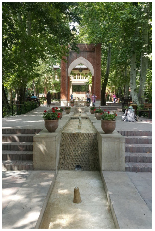
Fig. 3: North-South Route of "Persian Garden" Park.

claimed that the landscaping of the garden has been effective more than the other factors in absorbing the population (Atashinbar et al., 2015) and (Motlaghzadeh, 2002). Main and subordinate routes of the garden that creates spatial direction for the viewer provide various outlooks in each of the passages. Trees in the margin of the passages have limited viewing the surrounding areas, and by locating in the main route, human attention is diverted to the pathway and the mansion building at the end of the passage. In addition to the variety of spaces created in moving along the main and subordinate routes of the garden, providing various spaces such as platforms for the picnic and sitting on, sports areas and playgrounds for children cause different age groups to use the park for their purposes.