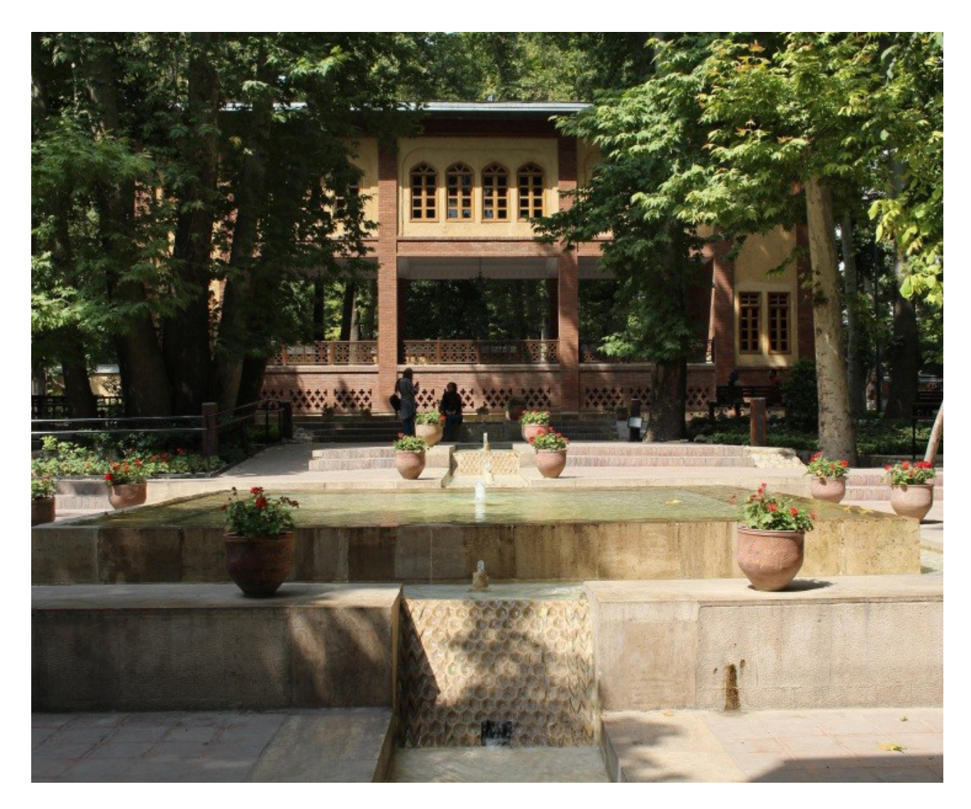
Fig. 4: Mansion and The Presence of Water in The "Persian Garden" Park. Photo: Maryam Mohseni Moghadam, 2017.

of the main route, due to the mansion being in the highest part of the garden (Heidar Nattaj, 2013). Due to overlooking all the garden areas, the view in this section is having special attractions for the viewers. The point that could make the role of the "Persian garden" park memorable in the minds of Tehran residents, as a collective space, is its location by the edge of Chamran Highway, which demonstrates a part of west Tehran as a landscape. This section is designed as the western entrance of the garden from Chamran Highway, but the administrative obstacles for the land ownership have caused this part of the landscaping not as yet to be constructed (Atashinbar et al., 2015).