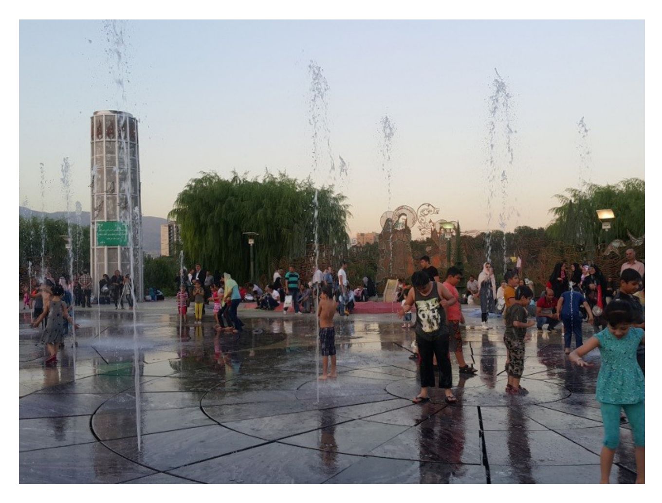
Fig. 6: Presence of Water in "Ab-o Atash" (Water and Fire) Park.

ous views of the city of Tehran from different parts of the park encourage the viewers for explorations as well as entertainments. Various facilities and spaces are designed for this park for different age groups, including sports spaces and children games, spaces for sitting and resting, picnics, restaurants and various coffee shops, views from "Tabiat" Bridge, and open amphitheatres. Although there no forms of Persian garden models in the physical structure and geometric shapes of this park, but the effects of aesthetic concepts can be found in some areas of the park that includes infinite views towards the surrounding landscapes, considering the spatial diversity, and presence of water in different ways and with modern styles from the Persian garden, which have caused the extensive welcome by the citizens.