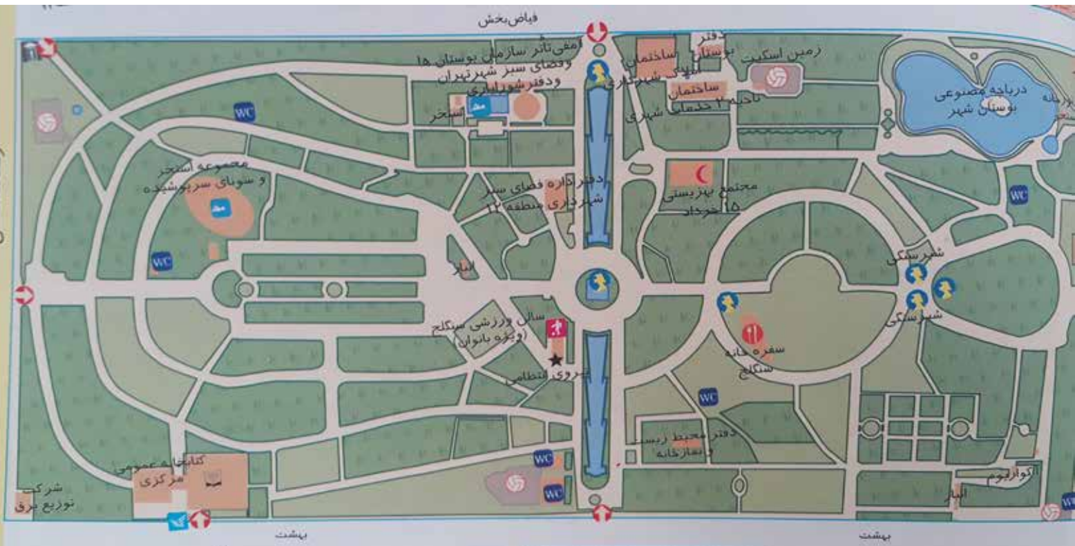
Pic. 5. City Park Plan.

Summary and conclusion | Regarding the evolutions during Pahlavi period and their influence on the formation of green public spaces in form of modern parks, it can be concluded that increasing the per capita of green space without considering the quality and the traditional background of green space patterns in Iran, will not result in favorable outcomes. Parks and green spaces were emulated during Pahlavi period. The table below compares the green space with