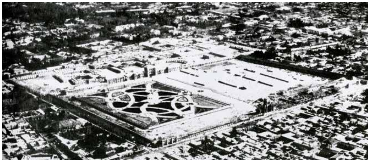
Pic 4: Aerial Photography of Tehran National Garden.

Today, trees and plants are used as merely decorative objects due to the influence of culture and beliefs that have imposed their theoretical view on human societies (Zamani et al., 2009). In modern urban parks, a large number of trees are planted that are separated from daily activities of people. As seen in its early examples in National Gardens and City Park, the trees are centered in a specific area and the people can walk along the specified paths in the park. In fact, the trees in the park do not have individual identities. Therefore, in this new type of green public spaces, the plants have lost their sense of holiness and the people's mentality of the trees is changed toward urban parks.