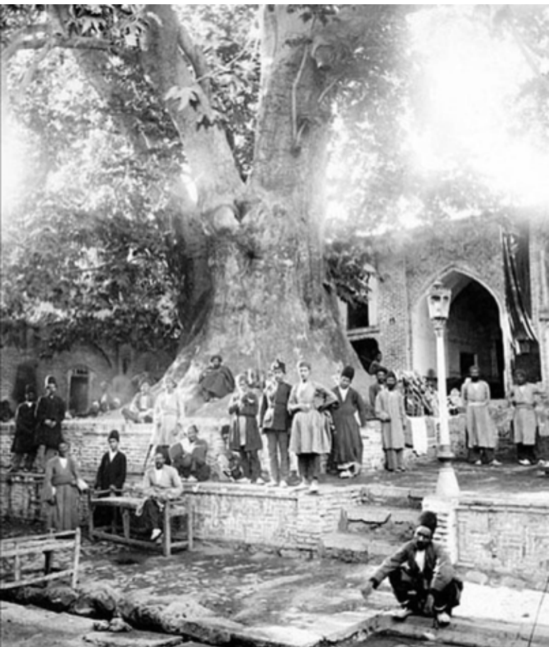
Pic. 2. An old plane tree near Imamzadeh Saleh.