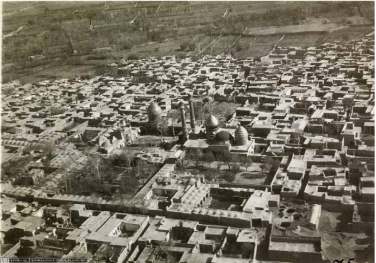
Pic 1. Shah Abdul Azim shrine and the surrounding gardens.

culture over Iranian urban community. In this period, urban politics in Iran had these conditions: dependent on oil revenues in terms of income, dependent on central government in terms of authority and management, and imitators of European methods in terms of beliefs (Kamrava, 2012). In practice, the goal and the realm of these policies encompassed the cities and urban social classes. Thus, on the one hand, there are civilian measures and activities to modernize the cities, such as the destruction of old neighborhoods, the construction of new streets and national gardens, and on the other hand, the state bureaucracy is expanded as a means to dominate and rule the central government and the daily activities of people (Katouzian, 2007).