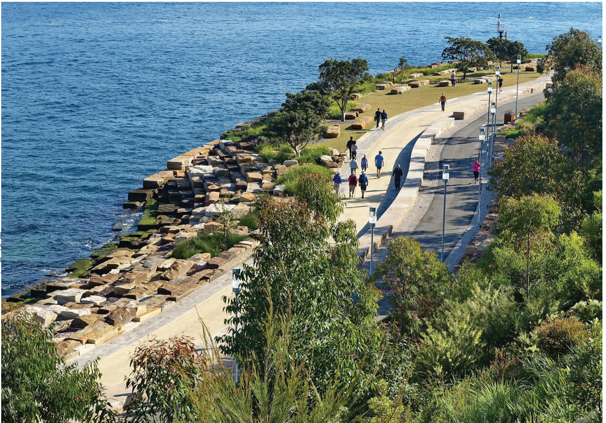
Pic 7: Barangaroo headland location among constellation of Sydney's naturalistic headlands.