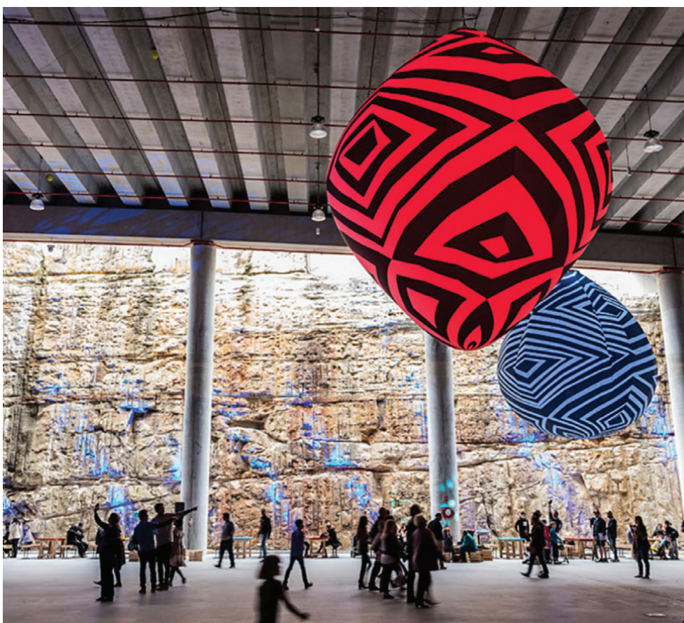
Pic 8: Pedestrian routes connecting Barangaroo reserve to Sydney city center.

considered as industrial heritage and are discovered while walking on the edges.