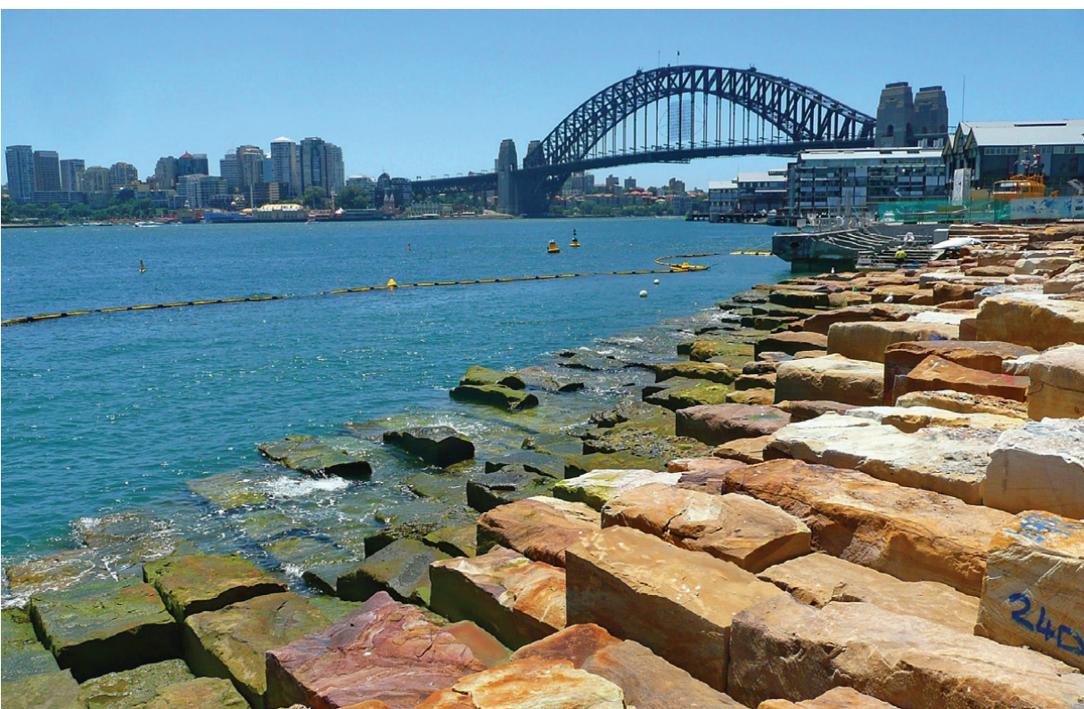
Pic 5: The wall in 1836 separating pedestrian and bicycle pathway along with defining shoreline in the beginning of industrial domination era.