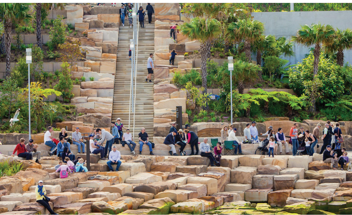
Pic 3: Excavated sandstone blocks recreate land form, along with providing the opportunity of engaging people with the natural edge.