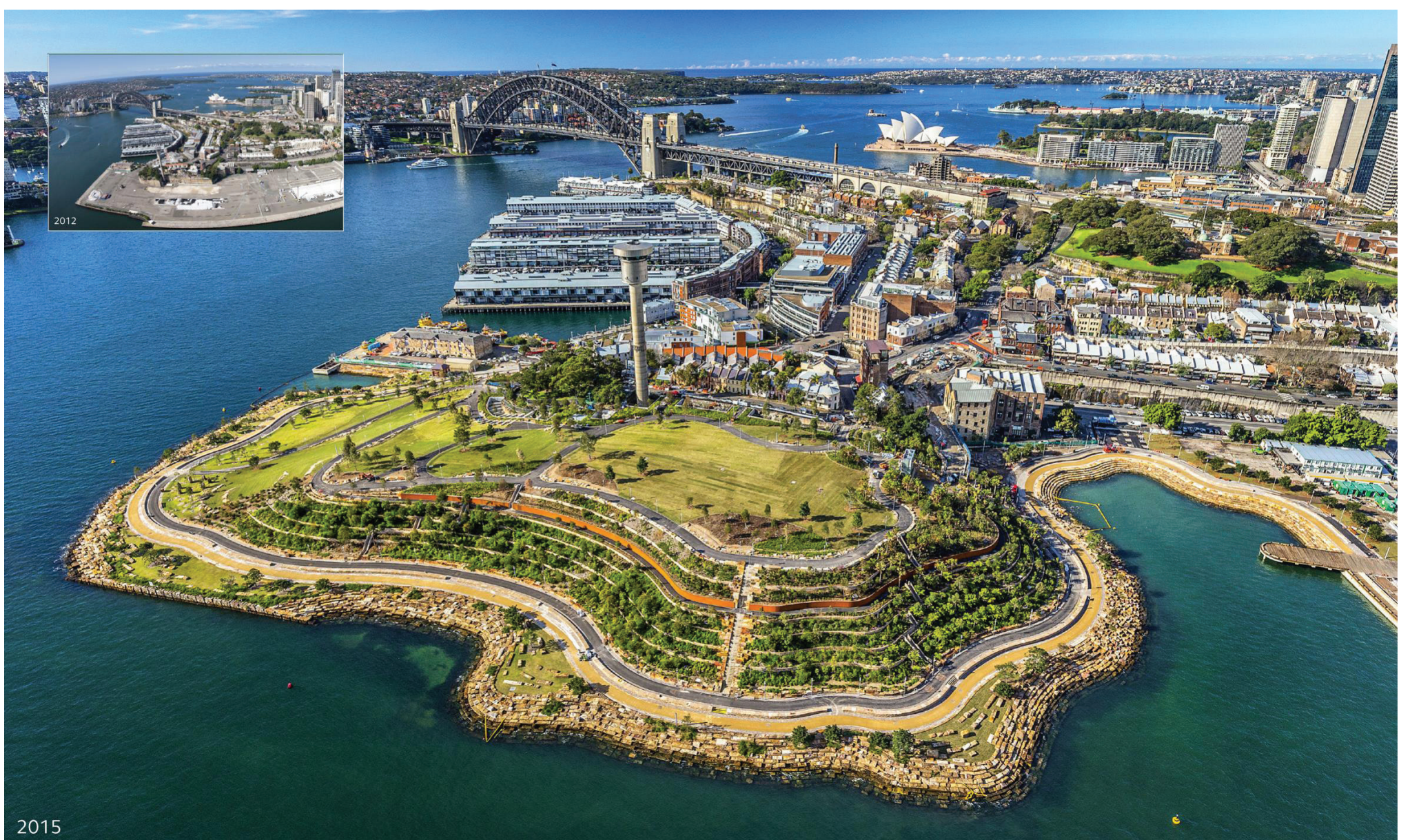
Pic 1: A preindustrial site returns to its natural morphology and more sustainable past.

Nowadays human interaction with nature and his perception of nature aesthetic play a significant role in urban landscape