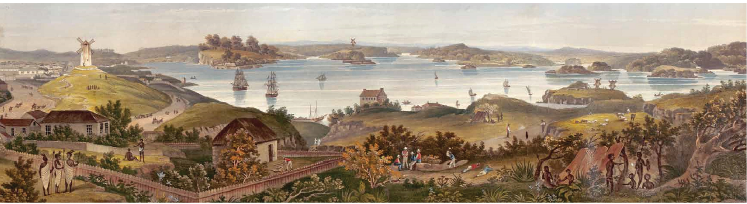
Pic 2: A painted lithograph of 1823, naturalistic lifestyle of indigenous people and location of Barangaroo headland among constellation of Sydney's naturalistic headlands.

quality and confrontation of industry and nature. On this matter, there is a varied range of opinions, which includes authenticating the natural essence of nature as a subject in a mental-conceptual point of view and authenticating human action as an object in a scientific-cognitive perspective (Table 1).