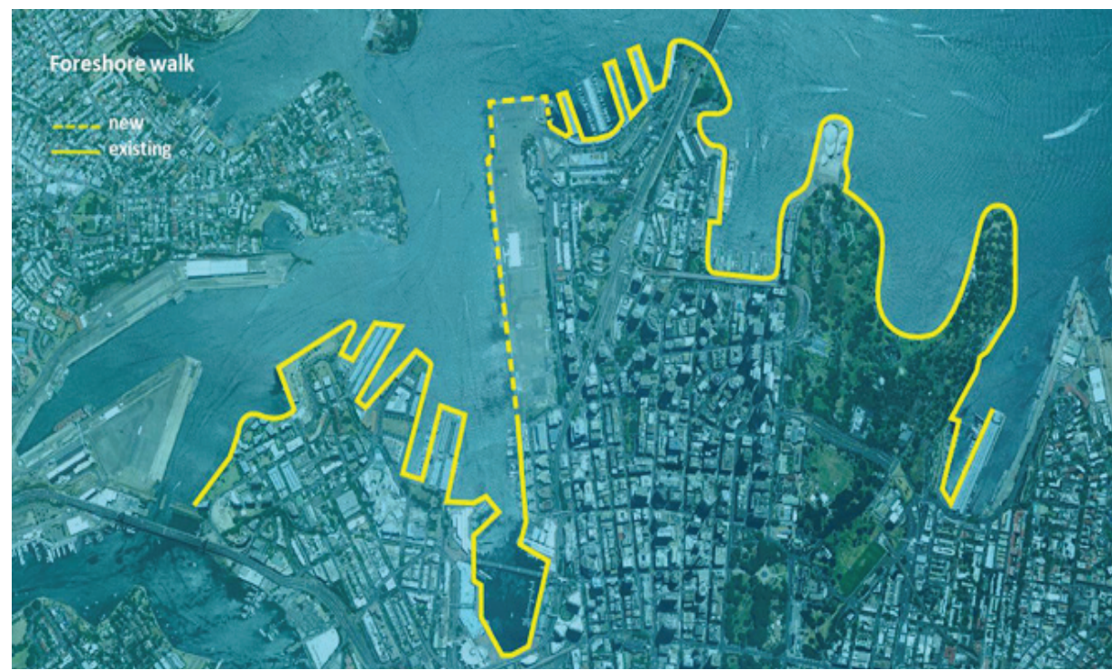
Pic 4: Project adjacency to high rise building in city center highlights its role as a natural refuge on the edge of industrial Sydney.