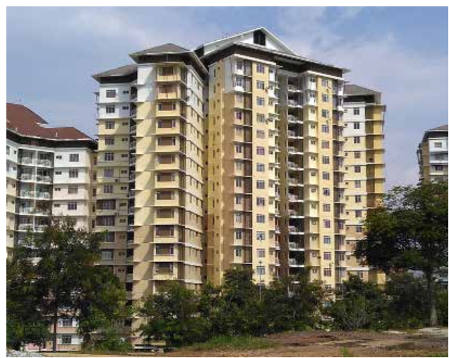
Fig. 1: the selected case studies.