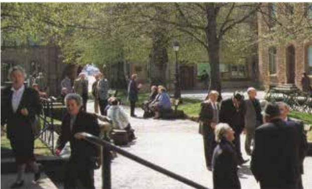
Fig. 10: an old shadow of lemon bee brush trees, old trees which refer to the old age of the locale and the sacred building.