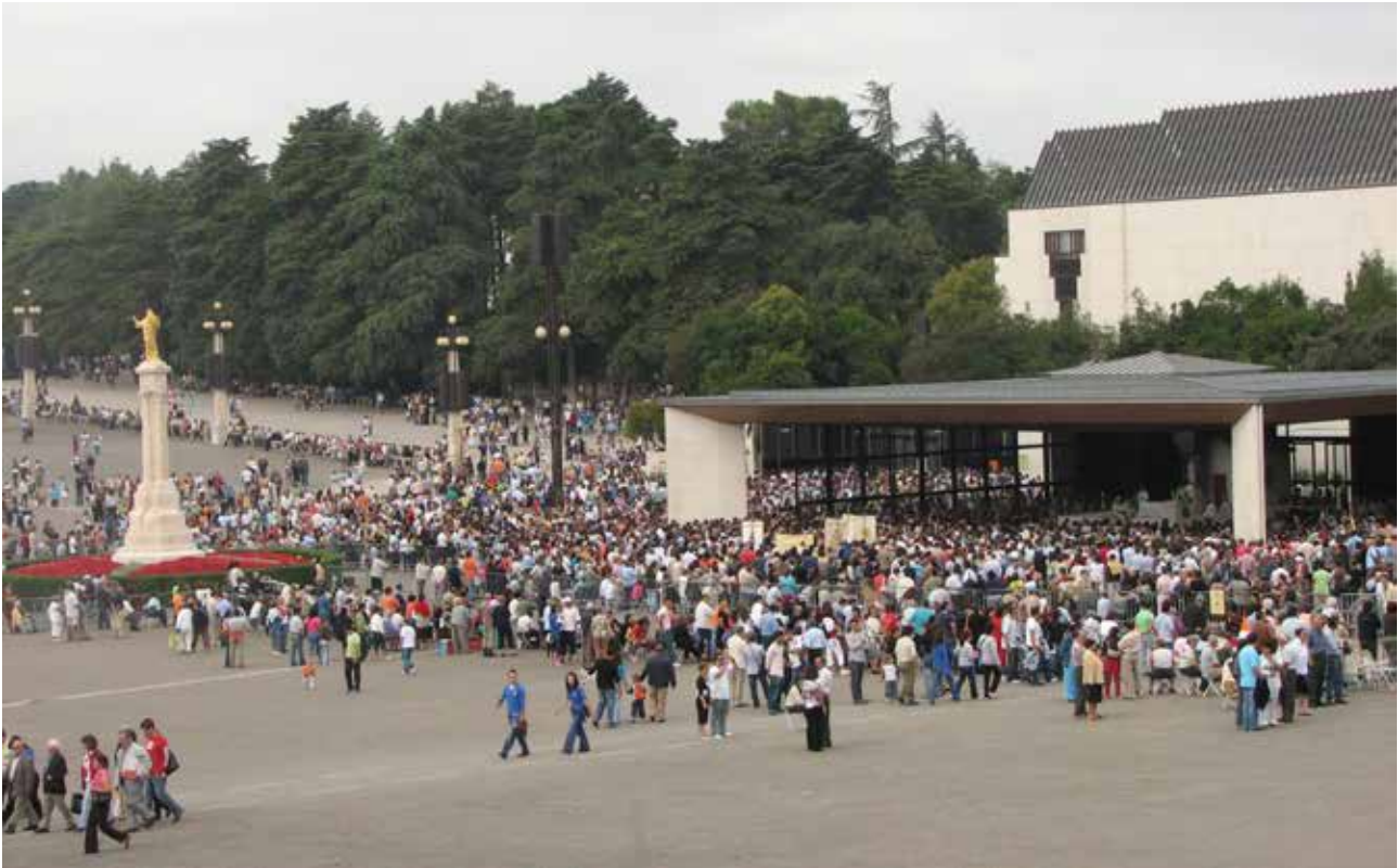
Fig. 6: Athe sanctuary of the virgin of the rosary Fatima, Lisbon-Portugal.

roots, and have only been repeatedly imitated during the centuries (Figs.13 - 15).