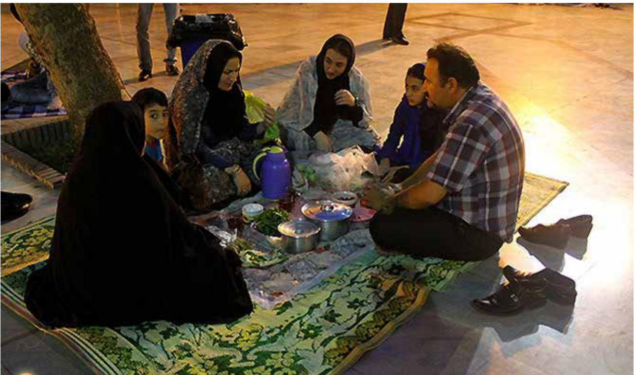
Fig. 2: Imam Zadeh Salih, Shemiran, Tajrish. Pilgrimage and ritual excursion.