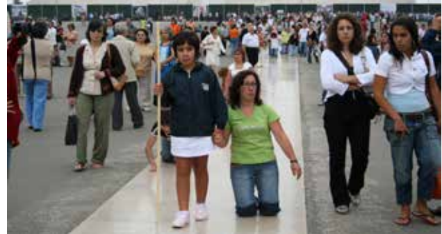
Fig. 7: sanctuary of the virgin of the rosary Fatima, Lisbon-Portugal.

In the recent years, many ritual-religious sites in Iran have been transformed into tourist hotspots. A huge number of people continue these rituals in their daily lives in order to reconnect to nature -through some features of these rituals- while also seeking for spirituality in modern adventurous life. Keeping this flowing social-epistemic stream and protecting such historical-ritual heritage requires a minute, sharp and unbiased knowledge to preserve and re-organize the related sites. Some of these sites have been ruined due to improper developments and the custodian's ignorance; or have barely been looked after. Founding convenient opportunities and running cultural programs would popularize ritual tourism. Rituals are the symbolic expressions of the beliefs arisen from the culture of a society; thus studying them and interpreting their significance is of essential importance and would deepen people's feelings for their country. Development in educational opportunities of historical, natural, religious and ritual tourism, in addition to reinforcing the approaches concerning social union would result in some sort of cultural-social unity in Iran which would lay the plots of linking Iran's tourism to other societies. Promotion of this method of tourism with its ancient Iranian cultural roots, would spiritually motivate the society on one hand, and familiarize the tourists with the conventions and customs of a vivid and