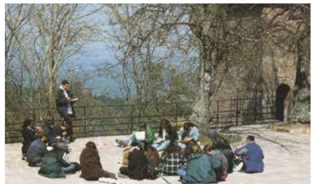
Fig. 11: a pilgrimage and enjoyment site for all the group ages.

ethical society full of sweet family recreational activities, on the other. Developing and conducting healthy and thoughtful excursions for the young generation, if accompanied with education and awareness -and not mere repetition-, would proliferate our identity and our inherited culture.