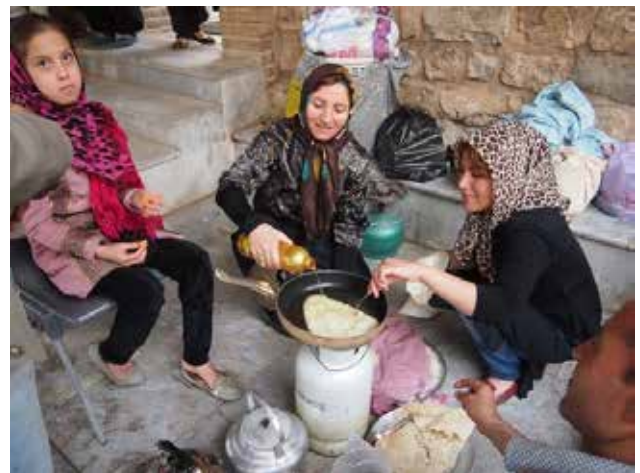
Fig.5: Bibi Shahrbanou's shrine, Rey, Tehran. excursion and cooking divine food offering.

popular act in European societies and among traditionalist Christians. The sanctuary of the Virgin of the Rosary Fatima in Lisbon (Portugal), the monastery of saint Odile of Alsace in France -located on the heights of a mountainous area, the holy cave (la Sainte-Baume) and statue of Mary Magdalena in a village named Durfort (near Marseille) in south France (Figs. 6-8), and le Mont-Saint-Michel located in north west of France, are religious hotspots which draw the pilgrims on foot, on their knees sometimes, carrying candles and saying mantra, hoping to get their wishes fulfilled, and trying to finish a quest towards the holy spring, cave or any other holy site, symbol of historical-religious incidents. The customary rituals of these excursions are very similar to the Iranian ones. It was a Sunday noon in the summer of 2011 when we reached the Sanctuary of Fatima (virgin of the Rosary) in Lisbon, with the "Nazar scientific-exploring tour", and faced the enormous crowd of the Christian pilgrims coming from different regions (Figs. 9-12). The ritual was being held at the top of the hill, near the fire, and the priest was preaching. In the nave