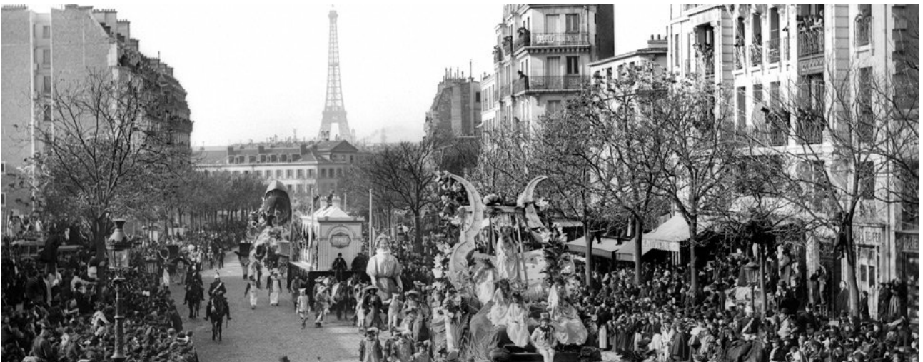
Fig. 15: Paris carnival in 1950s.