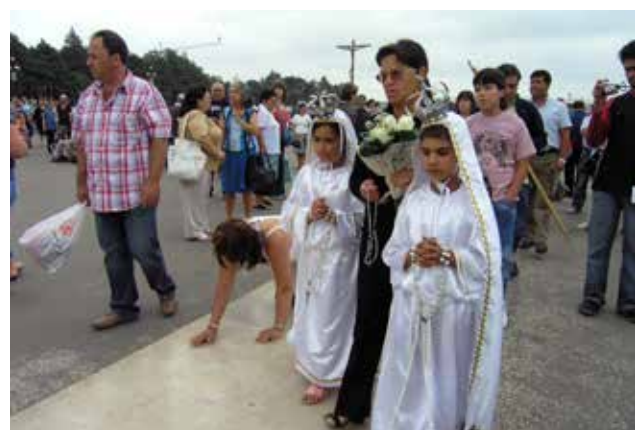
Fig. 8: sanctuary of the virgin of the rosary Fatima, Lisbon-Portugal.