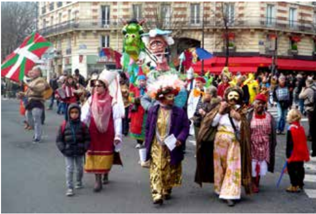
Fig. 14: a carnival, Paris-France.

The man's need for enjoyment, peace and integration with religious beliefs has made a special niche of tourism that has been alive since ancient times. Supporting the ritual tourism is an important issue in perception and development of Iranian-Islamic rich culture. This objective demands considerable protection, preservation and renovation of the religious-recreational sites in accordance to the current needs of the society. The ritual sites, representing the symbols and signs of ancient customs, are part of the valuable Iranian heritage of art and civilization, and must be protected and preserved in their original forms, as they are the manifestations of the cultural and religious continuity since the past. Such an enriched, lively and dynamic heritage in the field of ritual tourism is an honor and dignity for Iran.