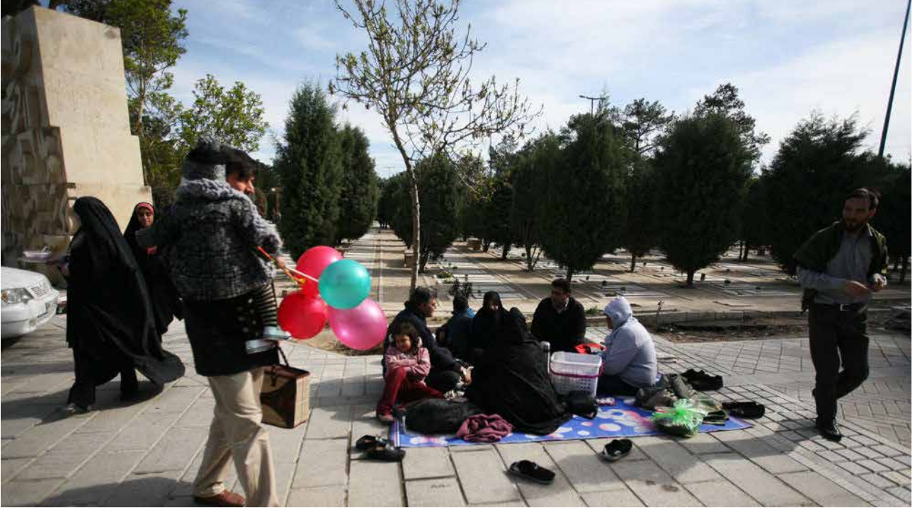
Fig. 1: Behesht-e-Zahra Cemetery, Tehran. Gathering of people, saying Fatiha (a prayer for the deceased) in memory of their lost beloveds, the ritual of pilgrimage alongside with recreational activities.