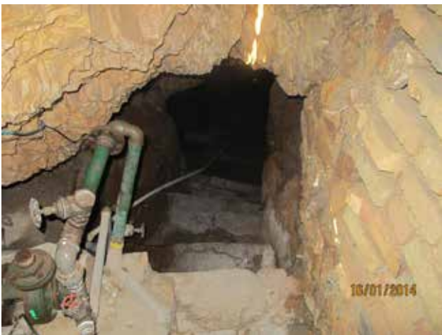
Fig.4: Inside the cave and the entrance stairway of the spring. Photo: Ive luginboul, 2014.