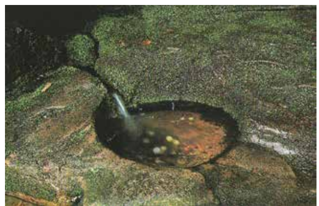
Fig. 12: Holy fountain.

ethical society full of sweet family recreational activities, on the other. Developing and conducting healthy and thoughtful excursions for the young generation, if accompanied with education and awareness -and not mere repetition-, would proliferate our identity and our inherited culture.