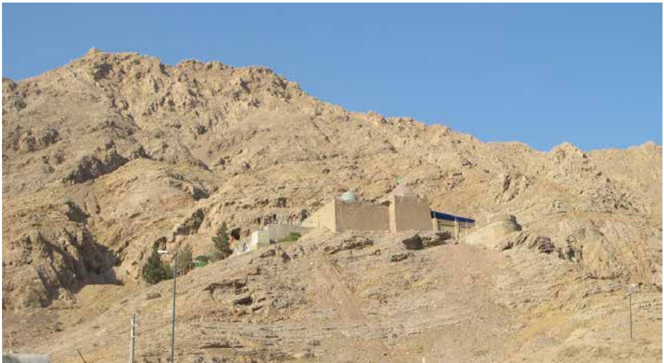
Fig. 3: A panoramic view of Bibi Shahrbanou's shrine, Rey city. photo: Ive luginboul, 2014.

In the same way, excursion and pilgrimage have been a