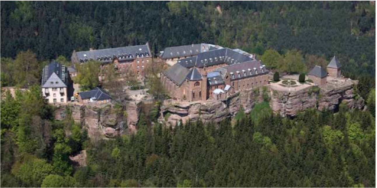
Fig. 9: A plan of the ninth c. a.d. Bulkawara Palace at Samarra, showing the doubled four-garden motif beyond the limits of the palace proper.