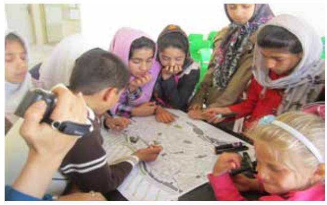
Pic.4: recognition of the neighborhood and drawing the details in the map by children.

3- Building capacity and enhancing participation: These projects have to upgrade the possibilities, abilities and potential capacities