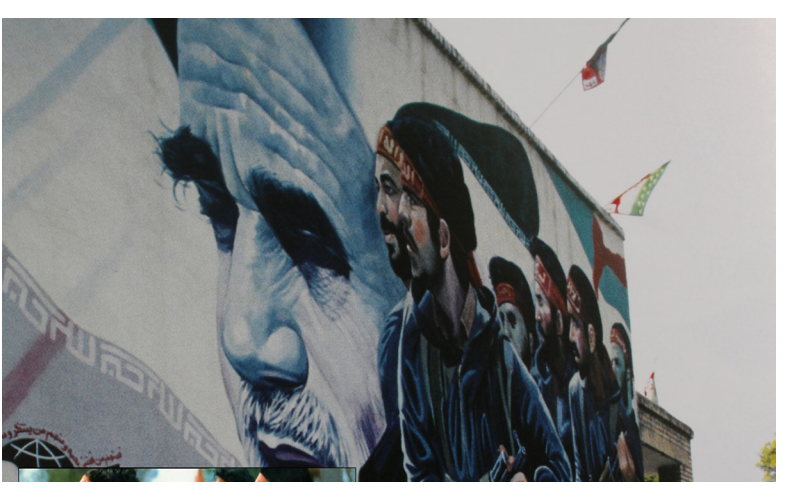
Pic1: A number of staffing photos with unacceptable composition (due to the lack of compliance with each other's face size and improper composition).

In some paintings, martyrs of a family painted, that is potentially the most influential works